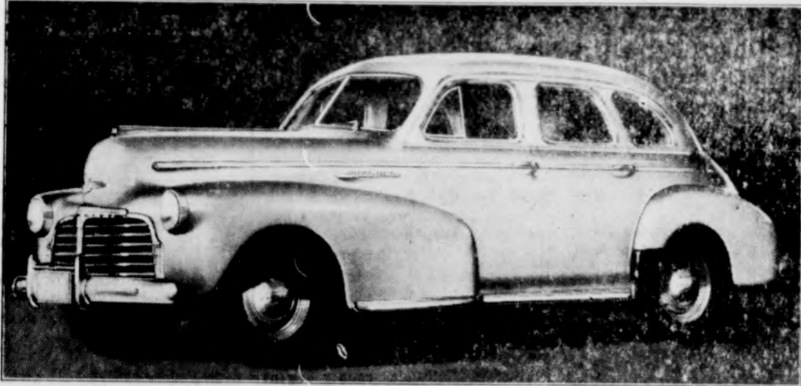
Distinguished styling, characterized by a new massive smart new elongated front fender, which sweeps back into and opens with the front door, are design highlights. Interior appointments are in the modern mode.