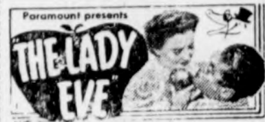
Color Cartoon—Dipsy Gypsy

Fri. - Sat. - Aug. 1-2 Matinee Friday at 12:00 a. m. and continuous show Saturday.