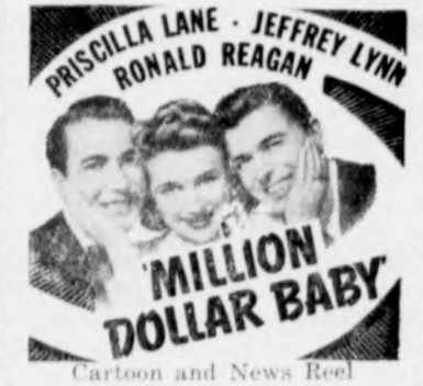
Cartoon and News Reel

Sun.-Mon.—Aug. 3-4 Continuous Show Sunday