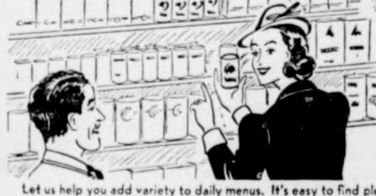
Let us help you add variety to daily menus. It's easy to find plenty of tempting appetite teasers from our well-stocked shelves.