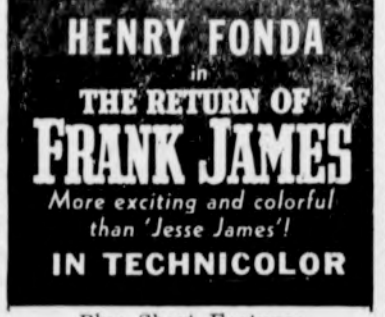
Plus Short Features