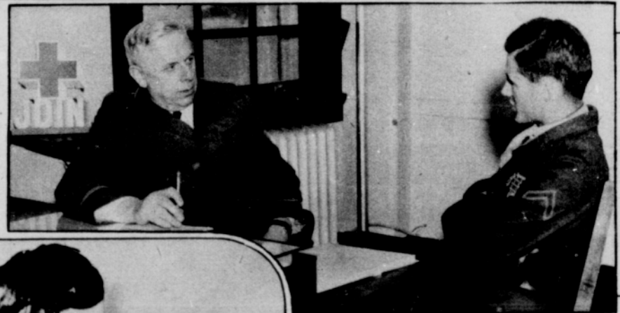
Men in U. S. military service turn to Red Cross field officers with their problems