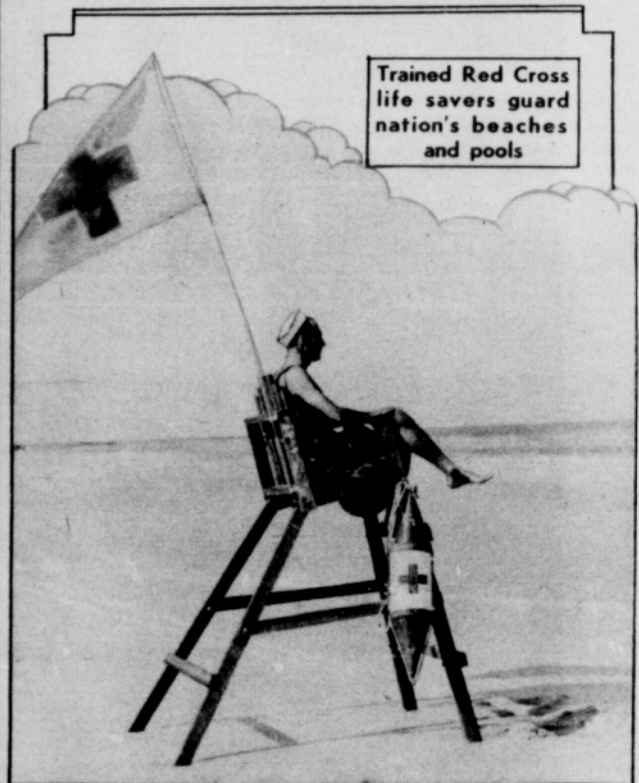
Trained Red Cross life savers guard nation's beaches and pools

These and many other Red Cross services for preservation of life and prevention of suffering are supported by men and women who join the 3,700 Red Cross Chapters and their 9,000 Branches throughout America. Your community helped in this work. Join your local Chapter during the Annual Roll Call, November 11-30. Do your part!