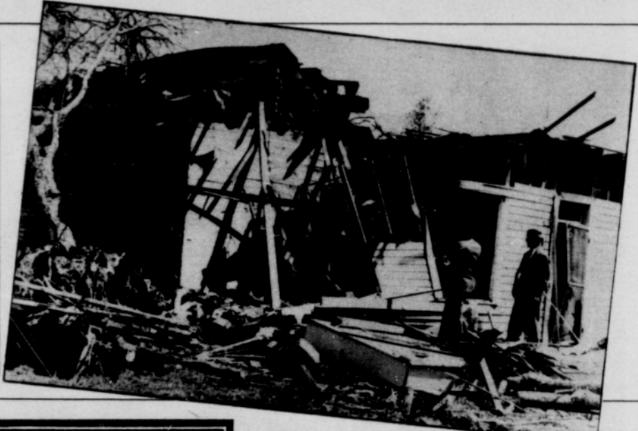
Havoc of a tornado to be restored by Red Cross