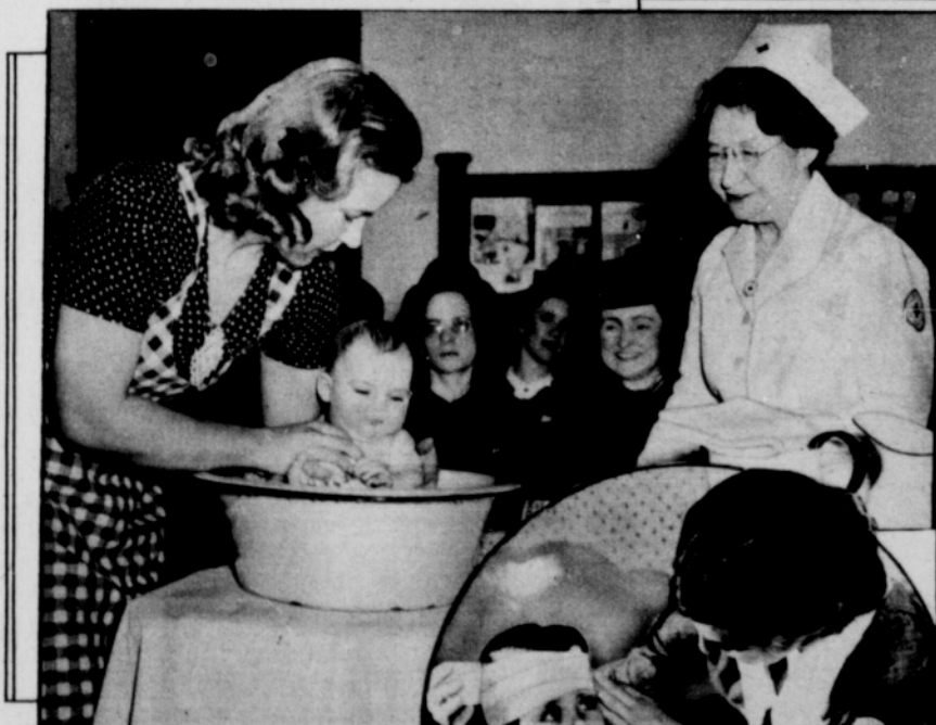
Valuable training in home nursing given by Red Cross aids health of the family