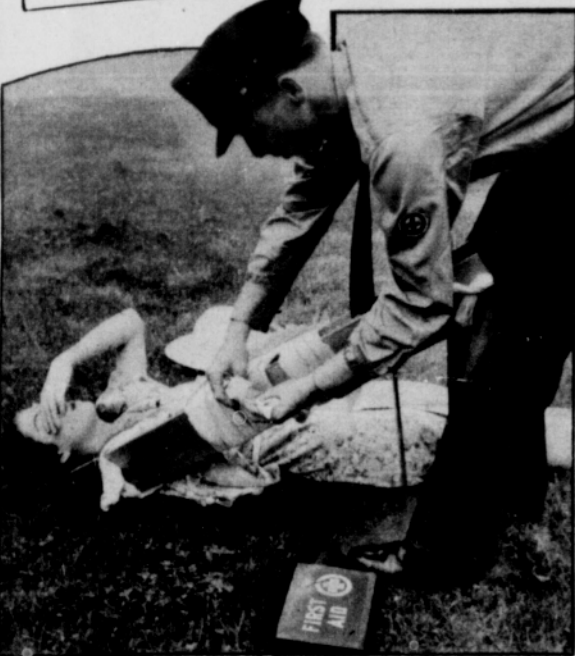
Police officer, one of 2,000,000 Red Cross first aiders, demonstrates aid to injured