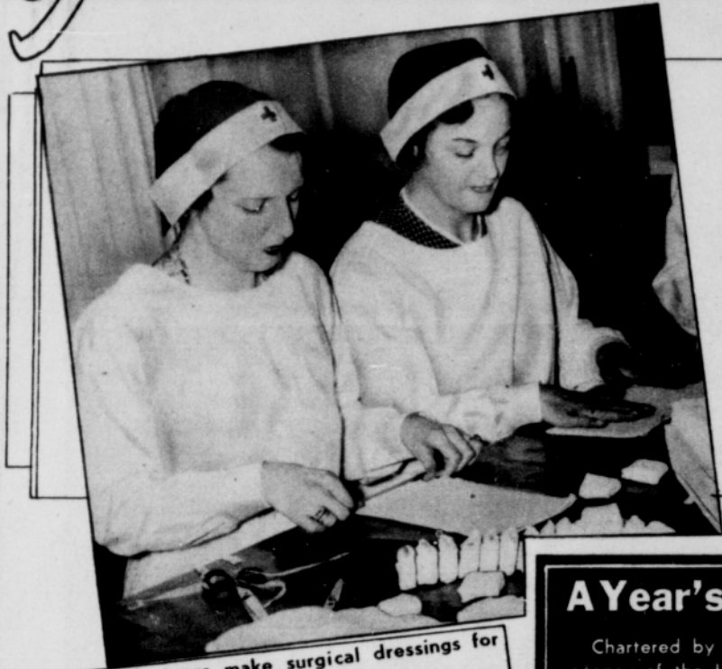
Women volunteers make surgical dressings for war wounded