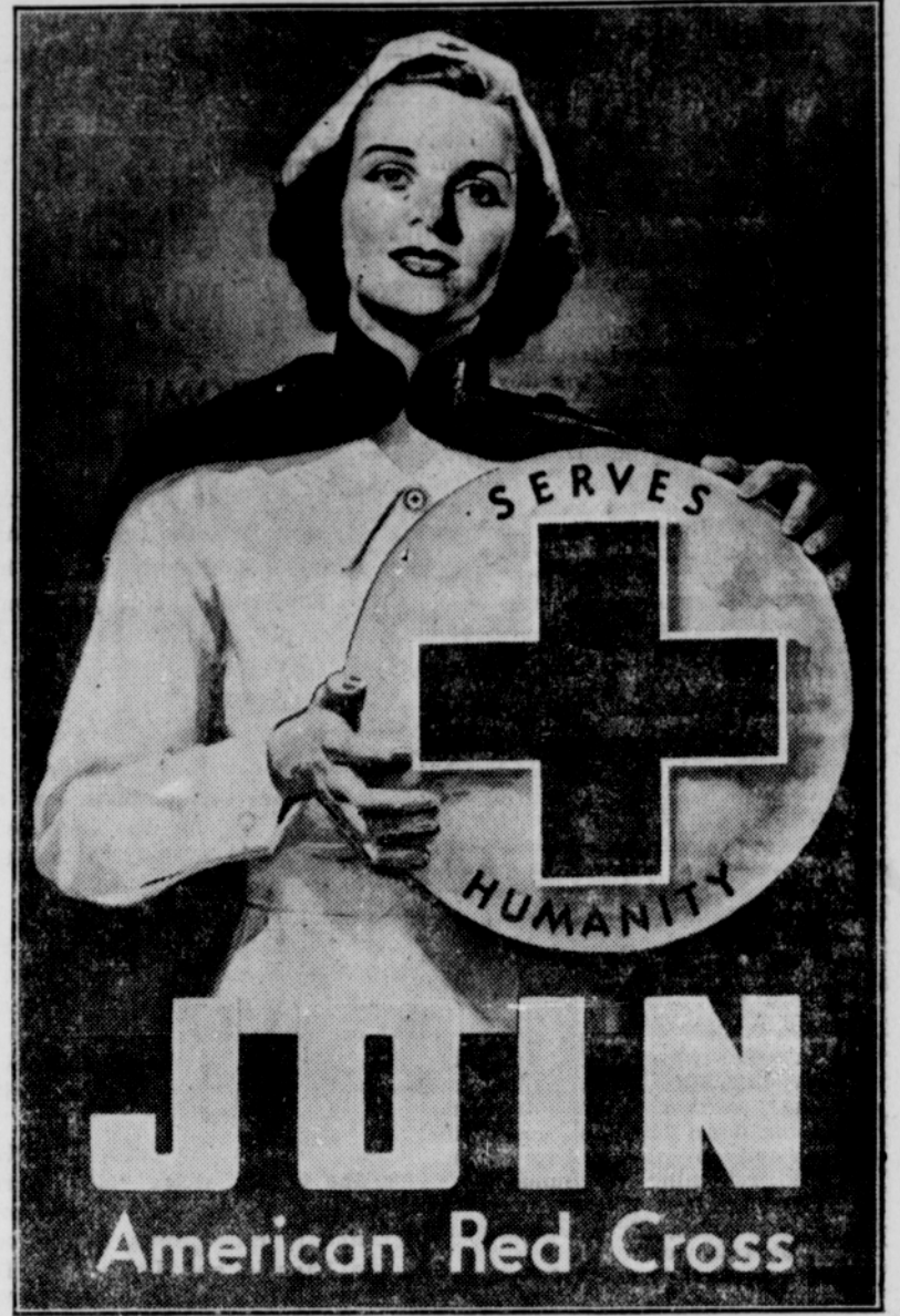
The 1940 Poster of The American Red Cross sounds the call to the nation to serve humanity within the ranks of this army of mercy.