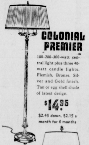
COLONIAL PREMIER 100-200-300-watt central light plus three 40-watt candle lights. Flemish, Bronze, Silver and Gold finish. Tan or egg shell shade of latest design.

...give several times as much light as ordinary lamps, yet there is no glare. The light is softened and diffused by translucent bowls. Here is genuine eye comfort and protection, especially when you're reading or sewing. These graceful and beautiful lamps will cheer up any room.