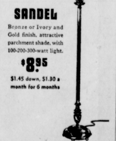
SANDEL Bronze or Ivory and Gold finish, attractive parchment shade, with 100-200-300-watt light.

$14.95 $2.45 down, $2.15 a month for 6 months