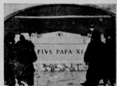
POPE SUCCURS—The devout kneel in prayer before casket containing the body of Pope Pius XI.