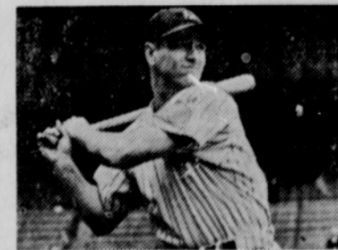
IRON MAN STRIKES OUT—Lou Gehrig, "iron man of baseball," retires from New York Yankees with paralysis infection after hanging up all-time record for games played.