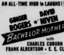
AN ALL-TIME HIGH IN LAUGHS! GINGER ROGERS + DAVID HOVIE BACHELOR MOTHER with CHARLES COBURN FRANK ALBERTSON - E. E. CLIVE

"Bachelor Mother" starts: 3:07 p. m.; 5:06 p. m.; 7:05 p. m.; 9:04 p. m.