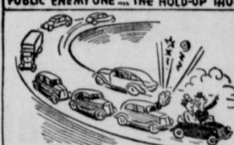
HERE'S NUMBER TWO... THE TRAFFIC SLUG!