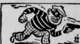
PUBLIC ENEMY ONE... THE HOLD-UP THUG!