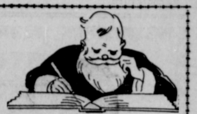
Santa Checks His List at Our Store—

Toads and frogs may live for a number of years if they manage to escape their natural enemies and remain in a suitable environment. There is a well authenticated case of a toad which lived for 36 years and was accidentally killed. The common frog sometimes requires from four to five years to mature in the North and barring accidents which are usual in a natural state would probably live at least ten or 12 years.