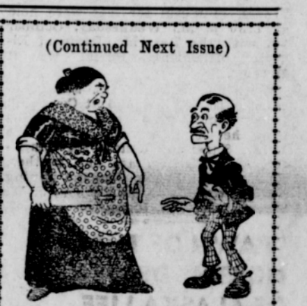
(Continued Next Issue)

BAPTIST CHURCH Regular Sunday services: 10:00 A. M., Bible school. 11:00 A. M., Preaching service. 7:00 P. M., Young people's meeting. Everyone is cordially invited to be present and worship with us.