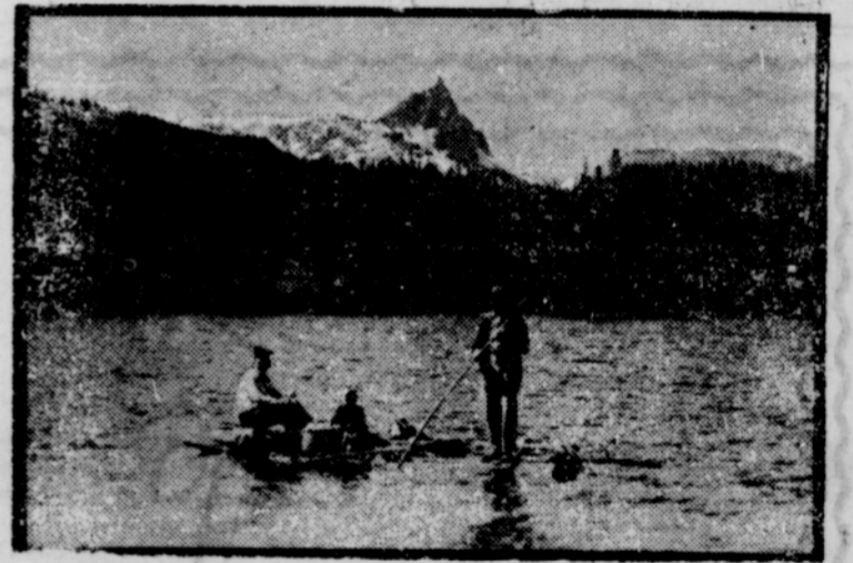
Fishing on Square lake, one mile north of Santiam Highway at Hogg pass summit, is done usually from rafts like this one

The South Santiam route over Hogg pass has long been designated by the bureau of public roads, the forest service and state highway commission as a future commercial route over the mountains, but the North Santiam