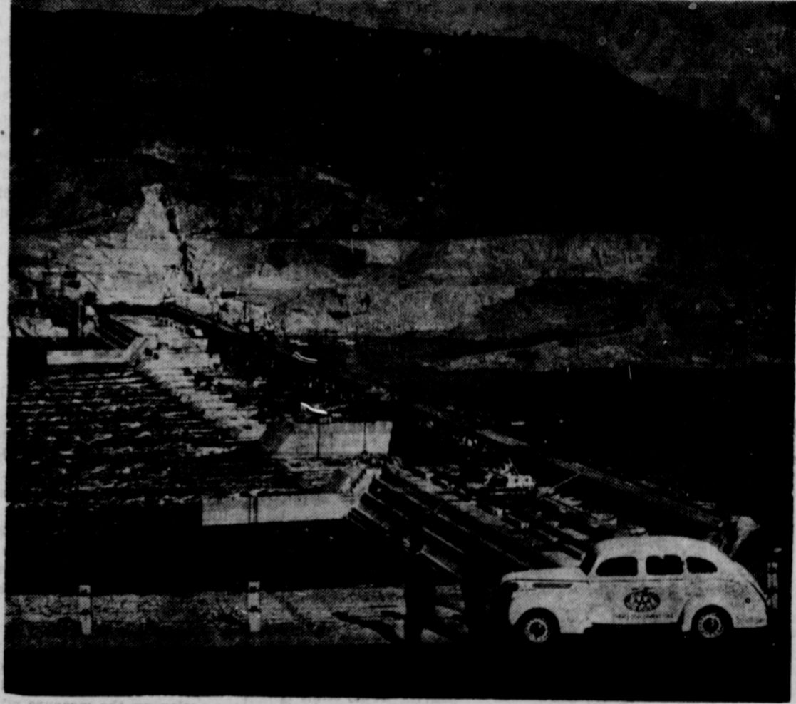
The motorlog car at the west end of Grand Coulee dam