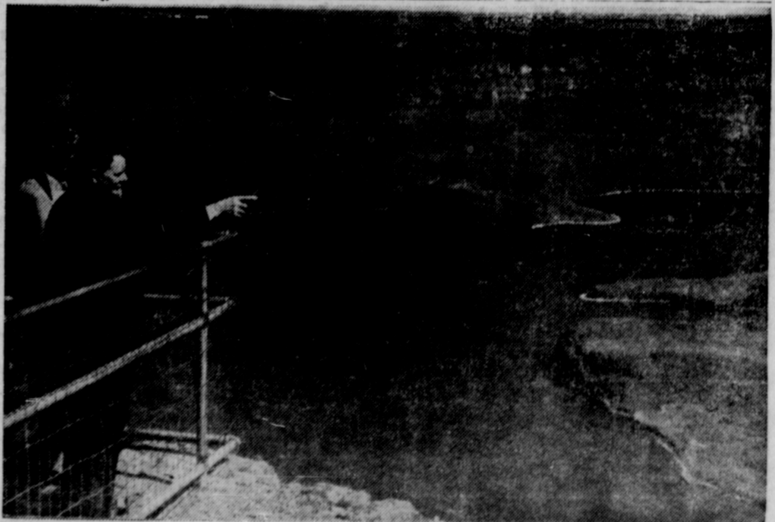
Inspecting the majestic grandeur of Dry Falls

The Coulee dam has brought more than 300,000 visitors to the sage-carpeted canyon walls of the Columbia last year, to gasp at this greatest product of the new deal's spending prowess. In one 24-hour period tourists from Hawaii, Africa, Manchuria and Nova Scotia were registered among the thousands of Americans and Canadians. Inspecting the majestic grandeur of Dry Falls over which once poured a cataract 80 times the size of Niagara. Below it the 20-mile-long lower Grand Coulee, a prodigious chasm of indescribable beauty. There's the Gingko petrified forest, graveyard of the sacred oriental gingko tree, turned to imperishable stone 30,000,000 years ago. The above scenes are published through the cooperation of The Oregonian and the Oregon State Motor association in presenting a series of motorlogs designed to stimulate travel in the Pacific northwest.