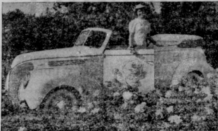
Her Royal Highness Queen Frances II, charming queen of the 1938 Portland Rose Festival, the Northwest's nationally-known event proudly stands in her official car, a white Ford V-8 convertible sedan. White Ford V-8s are also provided for the eight royal princesses by Ford dealers of Oregon and Southern Washington.