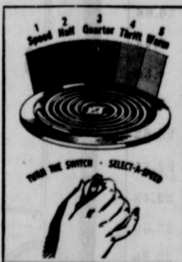
SELECT-A-SPEED CALROD Hotpoint's sensational new cooking unit which provides 5 different cooking speeds—the electrically correct speed for every cooking need.