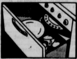
WARMING COMPARTMENT A spacious easy-sliding drawer, ideal for keeping food or dishes hot, without danger, until time for serving.

REVOLUTIONARY NEW FEATURE OF THE NEW 1938