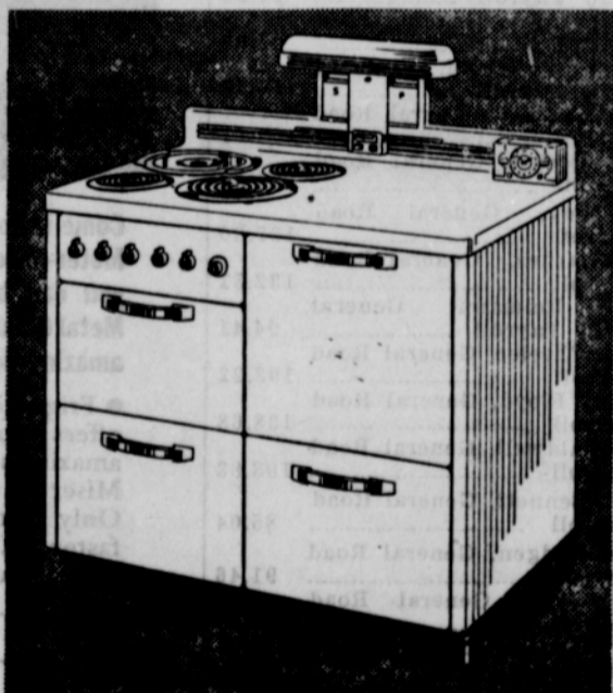
THE SALISBURY—Hotpoint's smart new 1938 built-to-the-floor electric range with semi-direct lighting, matched condiment set, Select-A-Speed Calrod. Full porcelain enamel.

WITH SELECT-A-SPEED CALROD 1. SPEED - 2. HALF - 3. QUARTER - 4. THRIFT (SIMMER) - 5. WARM