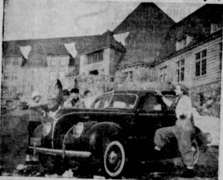
Timberline lodge, the federal government's contribution to the Northwest's Mount Hood playground, will open around February 4, according to present plans. The opening will mark the beginning of the winter season, chief attraction being skiing high on the slopes of the mountain where snow is available practically all year. Photo shows Shell Oil touring party unloading their de luxe Ford V-8 at the entrance of the massive lodge.