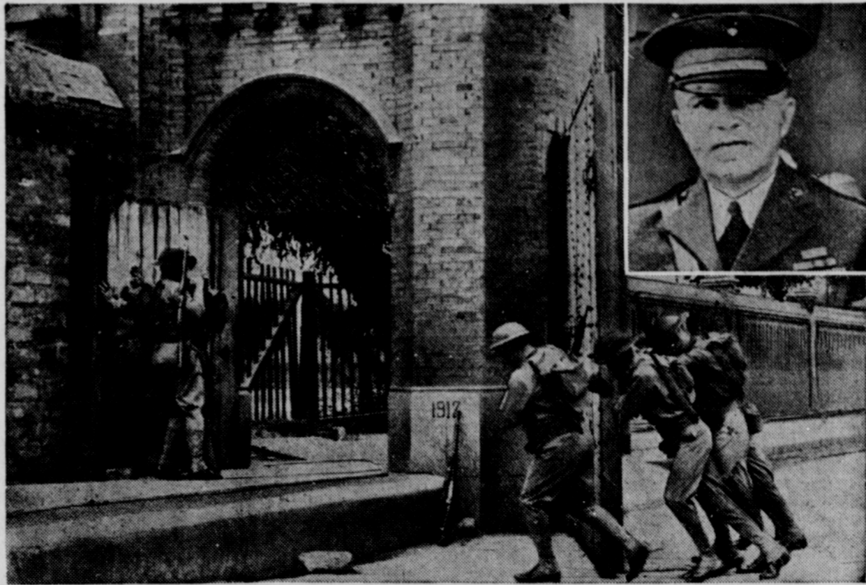
United States marines shown opening the ponderous gate of the U. S. legation in Peiping, China. Under the protection of the marines, American citizens find a safe haven as war rages between the Chinese troops and the invading forces of Japan. Inset shows Col. John Marston, commander of the U. S. marine barracks at Peiping.