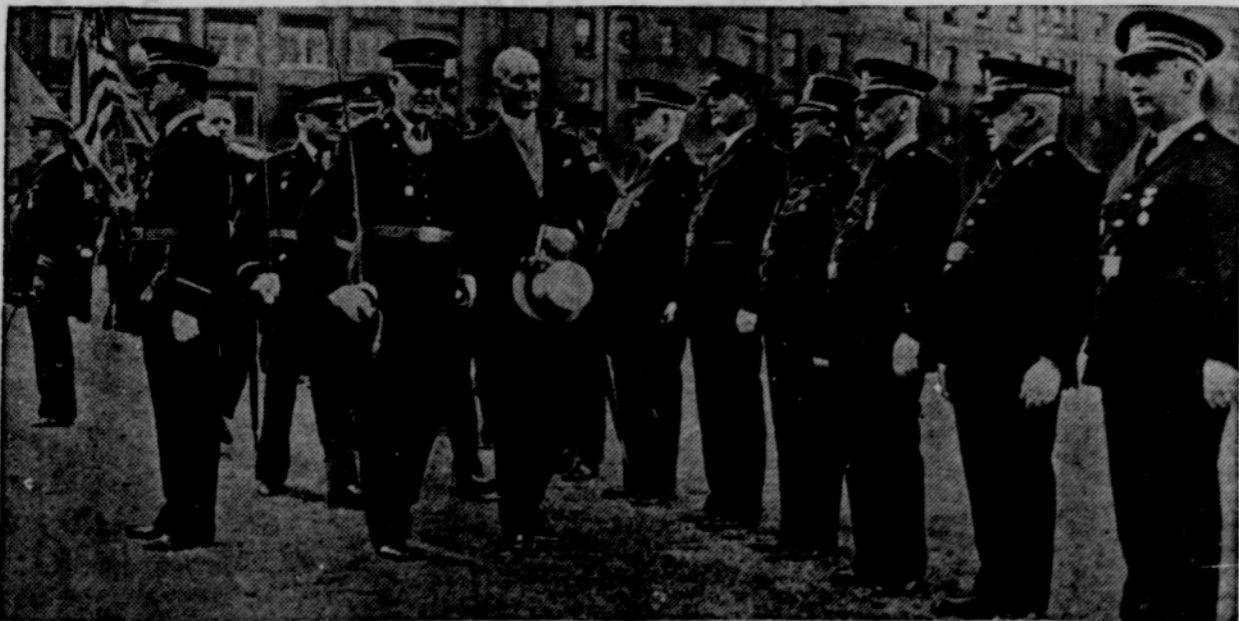
Sir George Broadbridge, the lord mayor of London, inspects the Ancient and Honorable Artillery Company of America during a garden party in honor of the British Honorable Artillery Company on the four hundredth anniversary of its founding recently. The British company is one of the most exclusive regiments in England. The American company dates from 1638 when a group of planters in America who had been members of the British company formed a similar regiment.