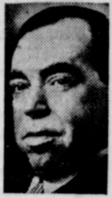
Irvin S. Cobb

Critics assert this legislation will cover business like a wet blanket over a sick pup, and point out that the number of sick pups benefited by being tucked under wet blankets is quite small. However, these fussy persons belong to the opposition and don't count. Anyhow, they didn't count much at the last election except in Maine, Vermont and one backward precinct in the Ozark mountains.