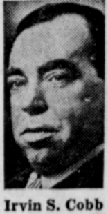
Irwin S. Cobb

It was the decade that began soon after the turn of the century and ended with 1914. Kings lolled securely on comfy thrones and dictatorships in strong nations were undreamed of. Without shaking the foundations of the financial temple, Teddy Roosevelt was filing the alligator teeth of predatory wealth.