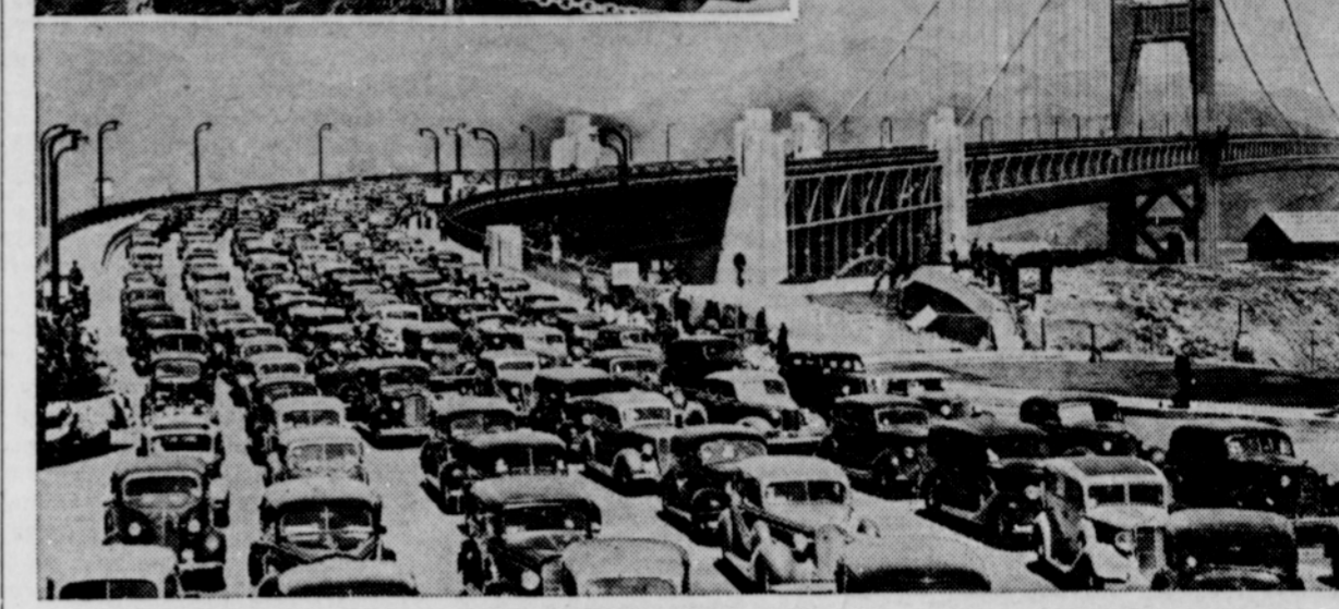
First automobiles shown arriving in San Francisco from Marin county across the Golden Gate bridge, following the recent gala opening of the span to motor traffic. Inset shows Mayor Angelo Rossi of San Francisco cutting a chain with an acetylene torch, thus officially opening the Waldo approach to traffic.