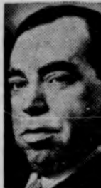
Irvin S. Cobb

Maybe you don't know it, but there's a lot of fox-hunting among us, especially down south. Being but a lot of stubborn non-conformists, southerners do not follow the historic rules. A party at large wearing a red coat, white pants and high boots would be mistaken for a refugee from a circus band. And anybody blowing a horn as he galloped across hill and dale would be set down as an insane fish peddler; and if you shouted "View, halloo! Tantivy, tantivy! Yoicks, yoicks!" or words to that effect, they'd think you were a new kind of hog-caller.