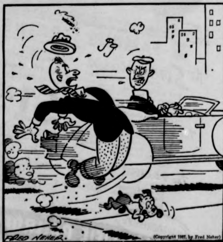
"Yes! An' some of you motorists drive around as if you owned the car!!!"