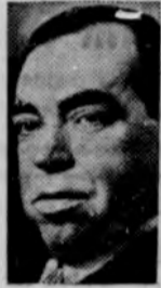
Irvin S. Cobb

So now we have set up a new mark for envious Florida to shoot at. For while they may have croupiers at Bradley's in Palm Beach, with eyes as keen and bleak as the condor's are, and real-estate dealers in Miami as greedy as he is, our frustrated rivals will be put to it to dig up a bird with a wing spread from nine to eleven feet.