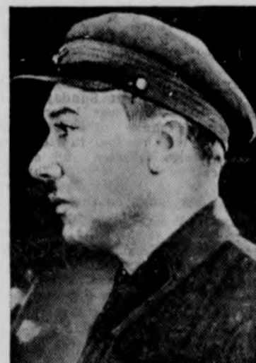
Genrikh G. Yagoda, former chief of the dreaded Russian OGPU (secret police), who is the latest celebrity accused of plotting against the life of Josef Stalin. Dismissed from his post of commissar of posts and telegraphs recently, he is reported now a captive in one of Moscow's grim prisons.