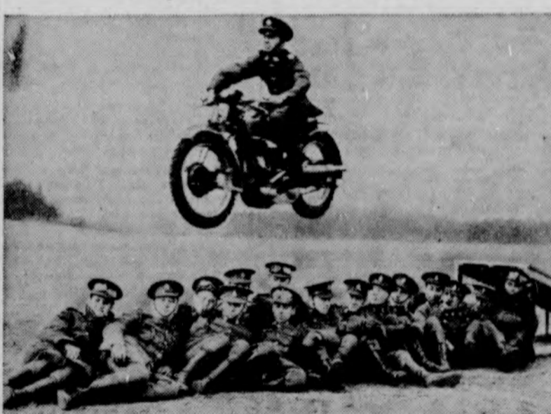
Imagine the feelings of the man at the end of this recumbent line of members of the Royal Signal corps if the trick motorcyclist underestimates the length of the jump. It's the end man that's ridden over roughshod. Everything turned out all right, however, in this test made near London.