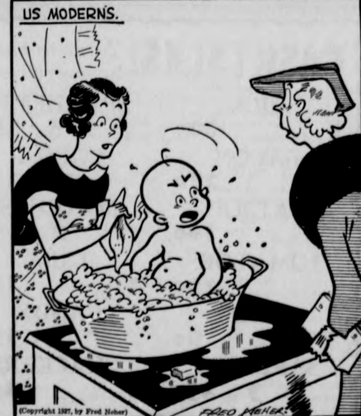
"Well, nose . . . what is it?!"