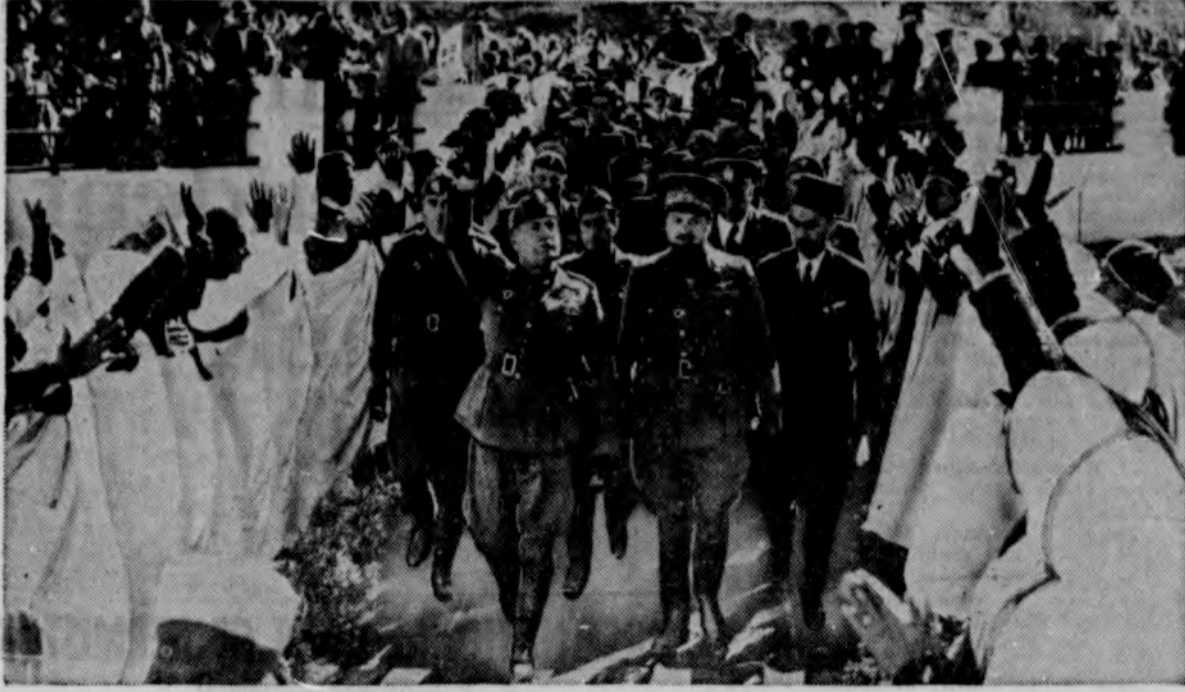
Stalking between ranks of white-clad Moslems, Premier Benito Mussolini of Italy (left) is shown with Gen. Italo Balbo, governor of Libya, as he made an inspection during his recent tour of the Italian colony in Africa. Il Duce pledged his word that Moslems in Italy's possessions would be protected and given full liberty to practice their own religion.