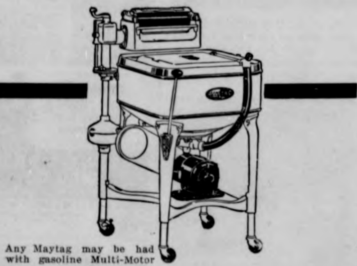
Any Maytag may be had with gasoline Multi-Motor