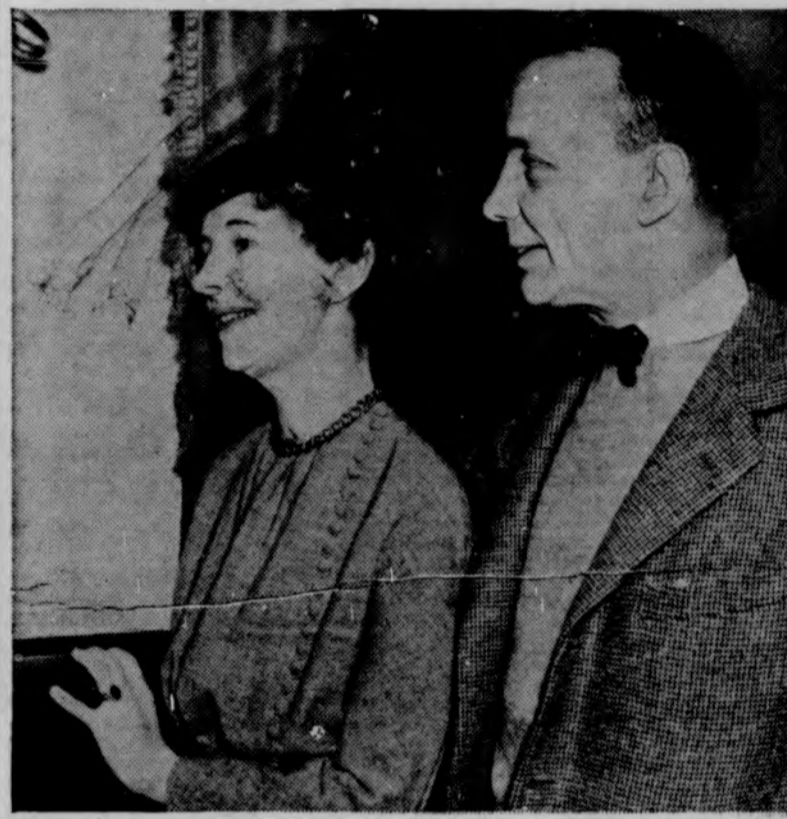
Col. and Mrs. Theodore Roosevelt shown as they arrived in New York recently aboard the S. S. Washington, after an extensive European tour, which included visits to important capitals on the continent.