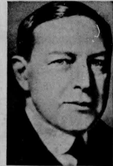
Sir Otto Niemeyer, a director of the Bank of England, whom the board of directors of the Bank for International Settlements elected to fill for three years the new post of chairman of the board that it is creating.