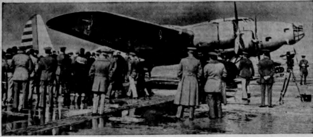
Uncle Sam's giant "flying fortress" attracted plenty of attention after arrival at the general headquarters air force base at Langley field. This giant Boeing bomber, multi-motored, heavily gunned, all-metal—and mighty speedy—is the last word in air fighters.