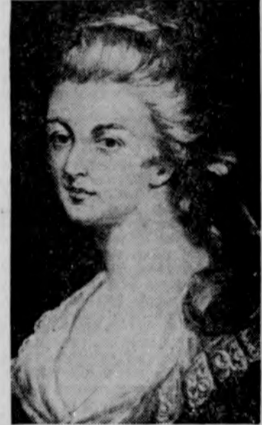
Mary Ball at 22, When She Wed Augustine Washington.

Mary Ball Washington was sixty-eight when the revolution began. Since communication was then so primitive, she often did not know for months at a time whether her son