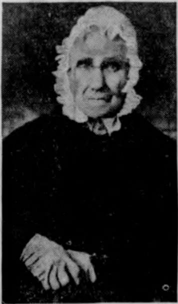
Nancy Hanks, Mother of President Abraham Lincoln.

He could not write his own name until the ambitious Nancy taught him how. But his ambition could not keep pace with hers. Her dis-