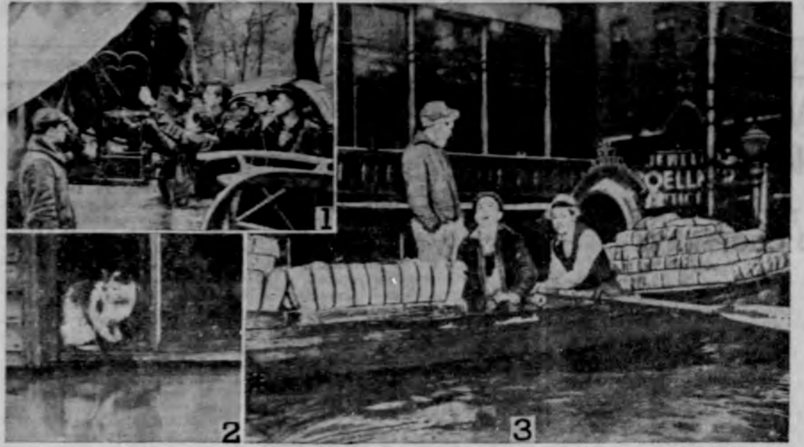
1—Flood refugees load their possessions aboard a truck prior to fleeing to higher ground. 2—Cat is marooned on a second story window ledge as Ohio river flood waters rise. 3—Flood sufferers at Portsmouth, Ohio, are fed by boatmen who row about streets, handing bread to refugees above the water line.