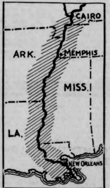
Map showing 100-mile wide strip along the Mississippi river from Cairo, Ill., to New Orleans which the War department ordered evacuated of all people in the most disastrous flood in the nation's history. Largest peace time removal of civilians in history, the project was conceived to save the lives of more than 500,000 people.