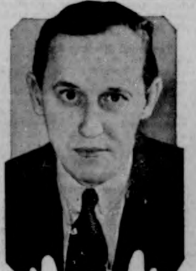
Harry L. Hopkins, WPA administrator who has directed the work of more than 50,000 federal relief workers in the flood area. Besides rescue and first aid work, the toolers have begun the task of rehabilitation—a job which it is estimated will confront Ohio and Mississippi river cities for several months to come.