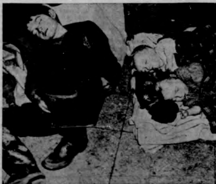
Refugee children from the flooded districts of northern and eastern Arkansas are shown asleep on the floor of a railroad station following their rescue. With millions of acres of farm land under water and countless cities inundated, the Ohio and Mississippi valleys experienced the most devastating flood in history.