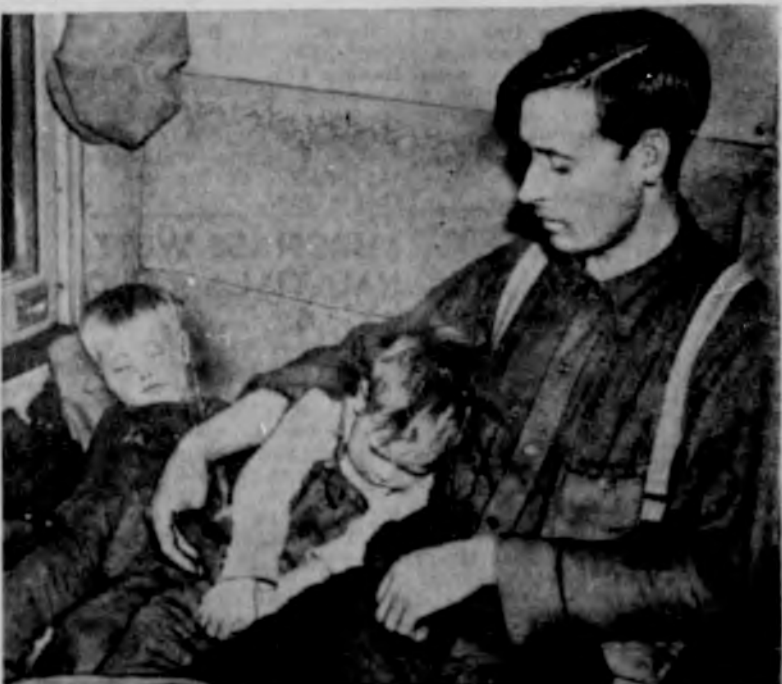
A father and his children, pictured in a refugee train as it left Portsmouth, Ohio, for haven and safety. They sleep the sleep of exhaustion, as did the majority who escaped the terrors of the great flood.