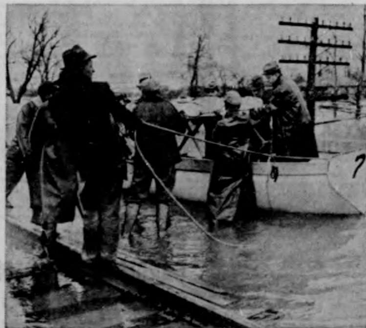
Flood victims in coast guard boats shown arriving at Jeffersonville, Ind., across the river from Louisville, Ky., where they were placed on refugee trains and taken to safety further north. Floods on the Ohio and Mississippi rivers were the worst in the history of the country. More than 1,000,000 people were made homeless by the treacherous waters that rose over retaining walls, inundated cities and towns and covered rich farm areas. Damage of property exceeded half a billion dollars.