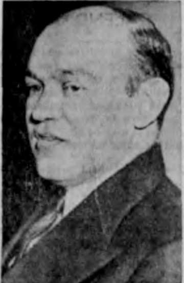
Secretary of War Harry Woodring, under whose orders army engineers and detachments of the regular military service worked to maintain the levee system along the Ohio and Mississippi to combat the raging flood waters. Secretary Woodring ordered the army to evacuate all persons from the Mississippi valley extending from Cairo, Ill., to New Orleans for 50 miles on either side of the river.