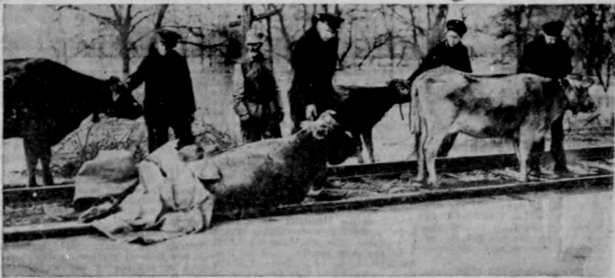
Members of the U. S. Coast Guard shown evacuating live stock and farm residents near Cairo, Ill. Her Coast Guard men are shown taking possession of cows found on a railroad right of way which is higher than the ground from which the flood had driven them.