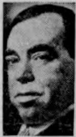
Irvin S. Cobb

In between, somebody is either trying to put Sister Aimee McPherson in a hole or get Tom Mooney out of jail. So far, neither undertaking has succeeded, but folks keep right on trying. Last month, it was Sister Aimee's turn. This month it's Tom Mooney's.