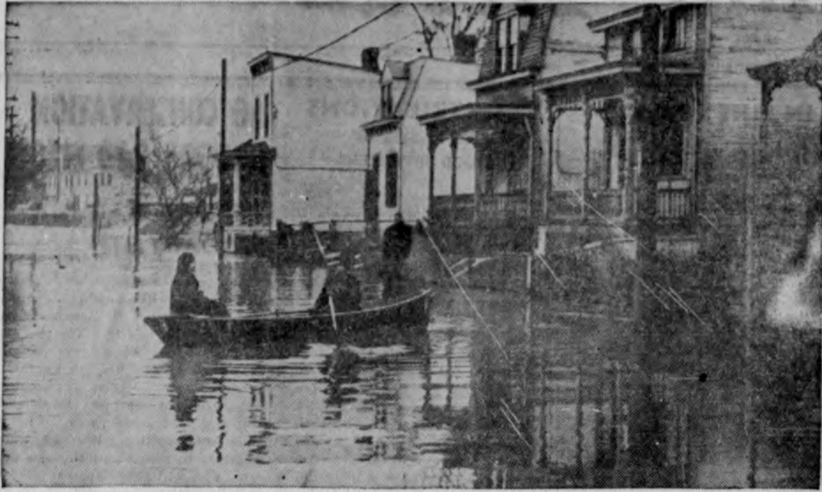
Police boat shown removing a water-imprisoned Cincinnati resident as flood waters following torrential rains swept the Ohio valley, inundating rural and city lands, causing deaths and untold suffering, as thousands of persons were forced to vacate homes and property, estimated at many millions of dollars, was destroyed.