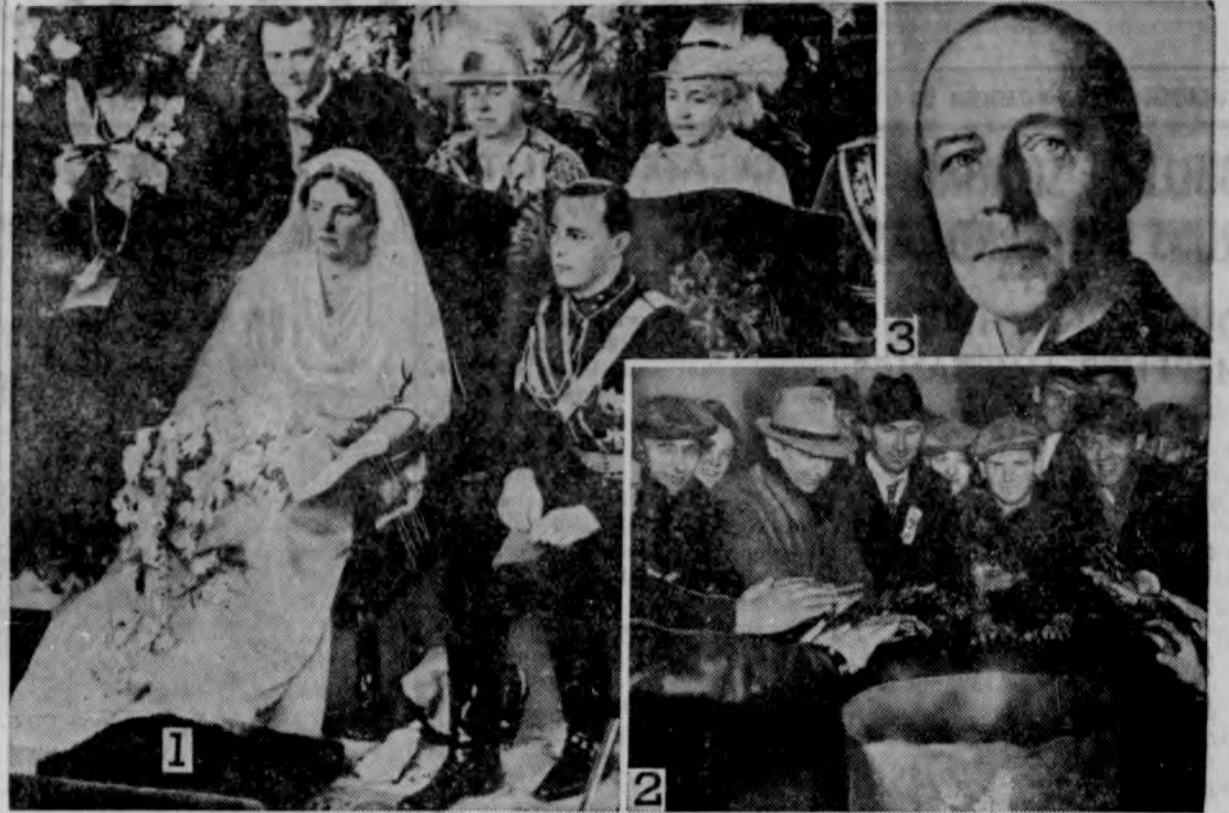
1—Crown Princess Juliana of Holland and her bridegroom, Prince Bernhard Zu Lippe-Biesterfeld, shown before the wedding. 2—Strikers picketing automotive plant warm themselves over an ash can stove. 3—Walter Runciman, chairman of the British Board of Trade, who is said to be negotiating trade agreement with President Roosevelt.