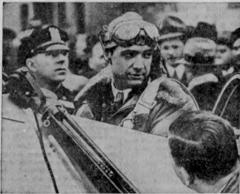
Howard Hughes, in the cockpit of his monoplane, "Winged Bullet," at the Newark airport after he had set a new transcontinental speed mark. Burning the wind at an estimated average speed of 332 miles an hour, the flying movie producer drove across the continent in seven hours and thirty-one minutes.