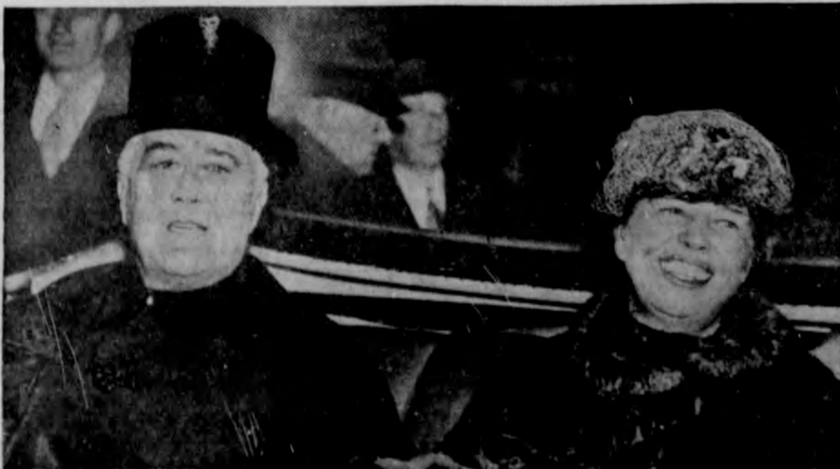
An excellent study of President and Mrs. Franklin D. Roosevelt as they appeared in their open car, following his second inauguration. Despite the downpour of rain, the President refused to disappoint those who had waited for hours to see him and rode in an open car to the White House.