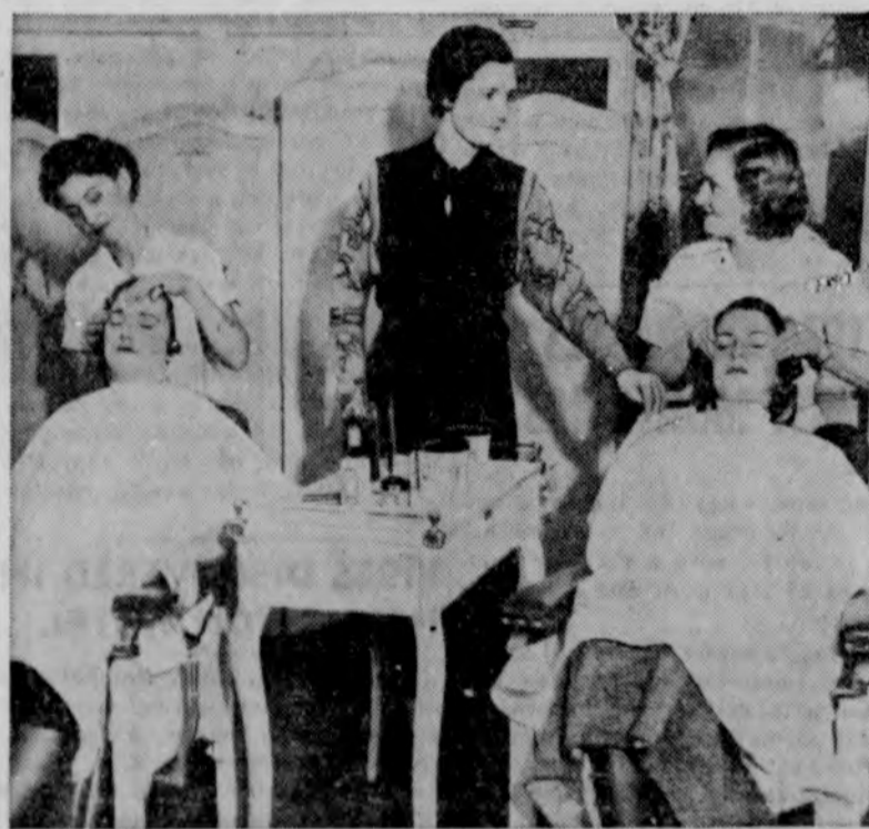
Students of the University of California, who have enrolled for a course in "Cosmetology," taught by an expert cosmetician. The students learn by practical experience the intricate methods used in feminine beautification.