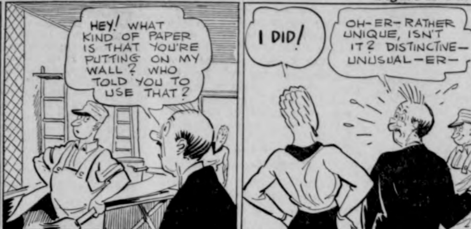
Figure It Out