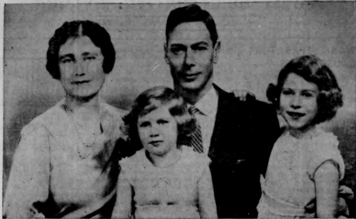
On the abdication of King Edward VIII, to marry Mrs. Wallis Simpson, his brother, the Duke of York, ascended the throne of England as George VI. It is expected the coronation will take place next June. Bringing a dispute which had brought the empire to a crisis, Edward voluntarily relinquished the throne. Photo shows King George with Queen Elizabeth and daughters, Princesses Elizabeth and Margaret Rose.