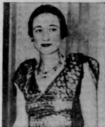
Mrs. Wallis Waiford Simpson, for whom King Edward VIII abdicated the throne of England. Edward's romance with the former Baltimore beauty precipitated a government crisis before the monarch solved it by abdicating. Going into voluntary exile outside of the British Empire, the former king is expected to marry Mrs. Simpson as soon as her divorce decree becomes final. On the abdication of King Edward, his brother, the Duke of York, ascended the throne.