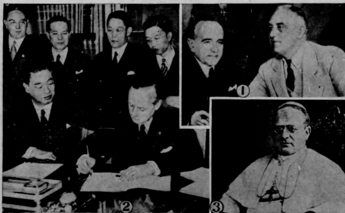
1—President Roosevelt shown as the guest of President Vargas of Brazil on his recent South American tour. 2—German and Japanese diplomatic representatives in Berlin signing treaty agreeing to combat communism, an action which Russia believes is aimed at the Soviet government. 3—Portrait of Pope Pius XI made before his illness.