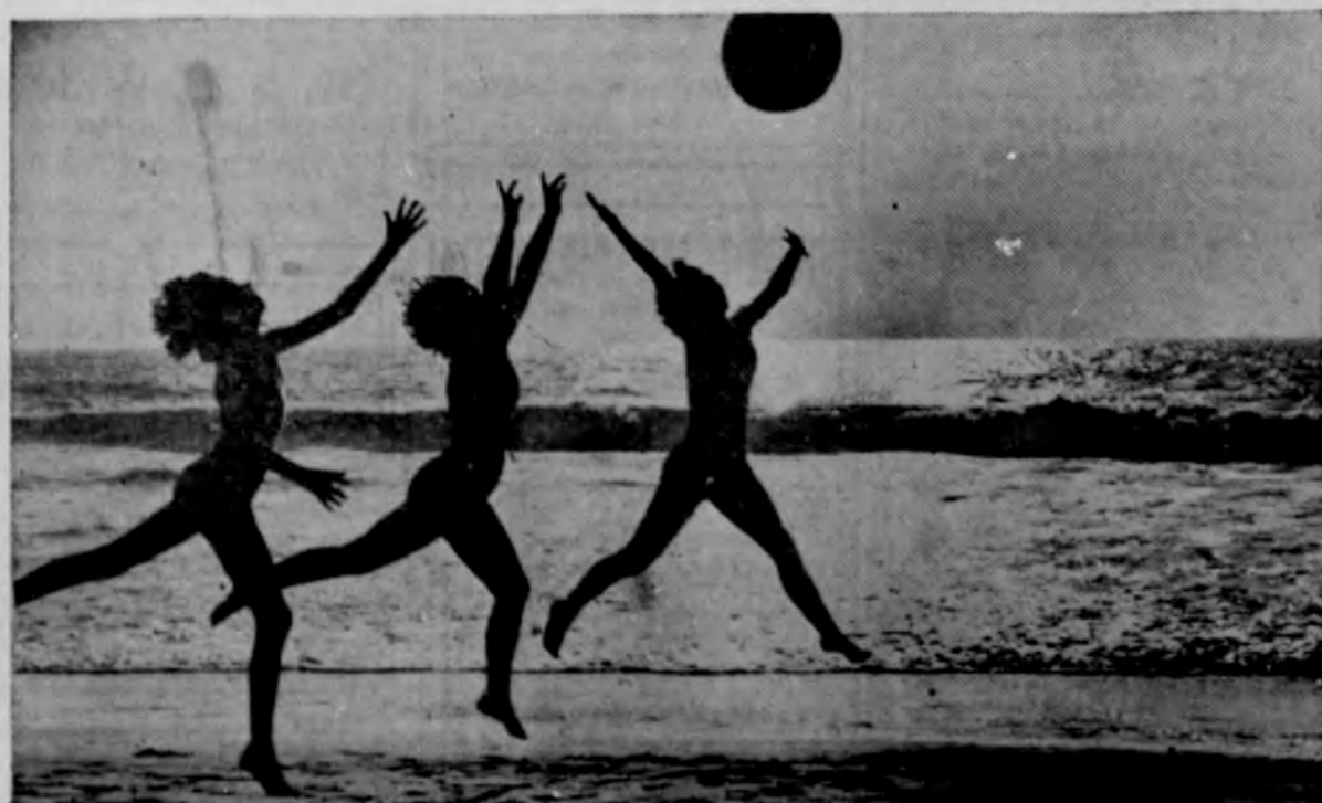
Coronado's Silver Strand, near San Diego, (Calif.) is an autumn and winter playground for America's social register set. In the above photo, three of the younger set are shown on the famous strand at eventide.