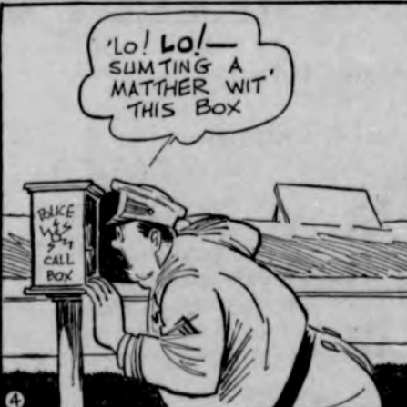
Figure It Out