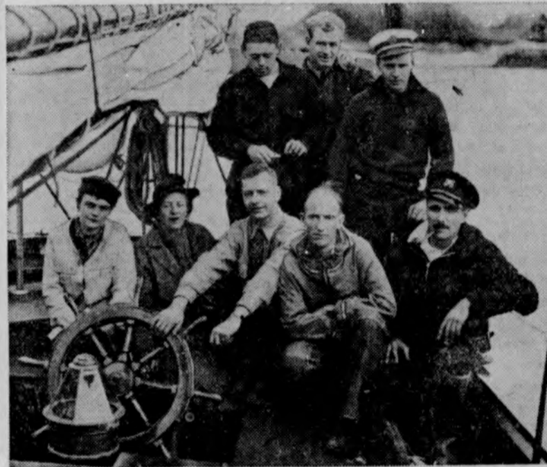
Members of the Denison-Crockett expedition of the Academy of Natural Sciences of Philadelphia aboard their schooner "Chiva" before sailing from Gloucester, Mass., for a study of anthropology and zoological specimens on seldom visited islands of the South Seas.