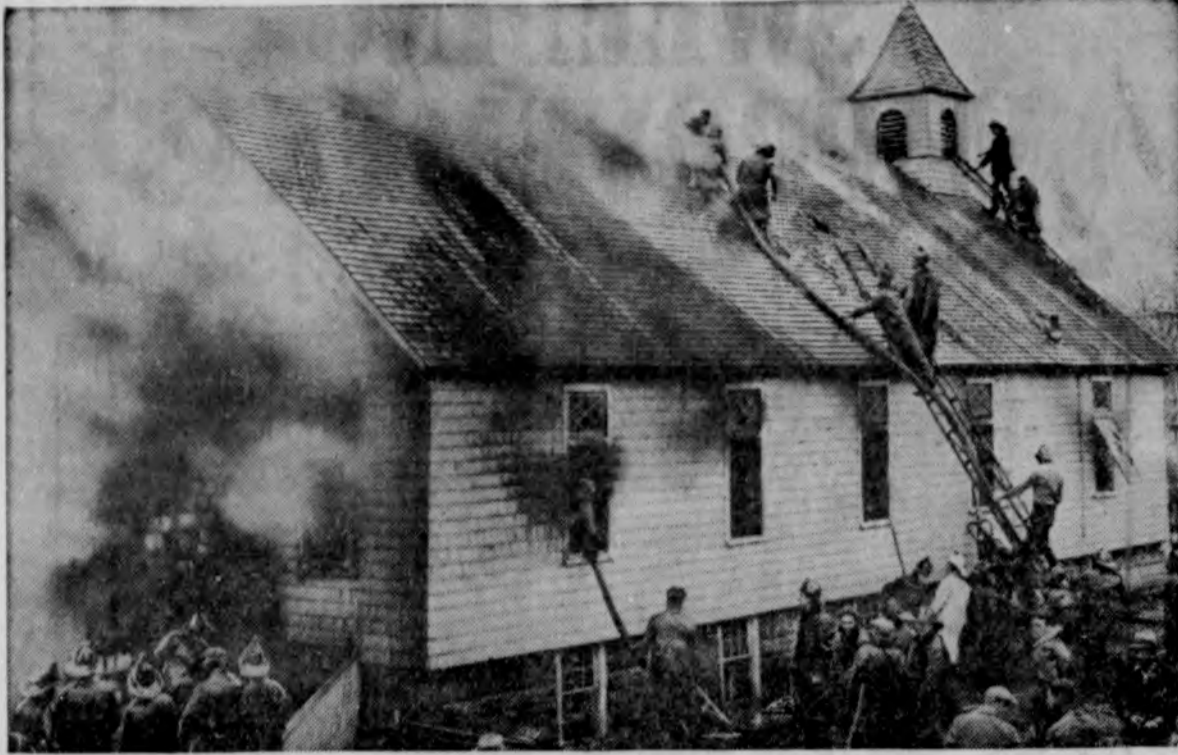
Firemen are shown battling the blaze which gutted the African Baptist church of Freeport, N. Y. The fire started at 10:30. Four firemen were overcome by the dense smoke, as the entire village turned out to watch the blaze.