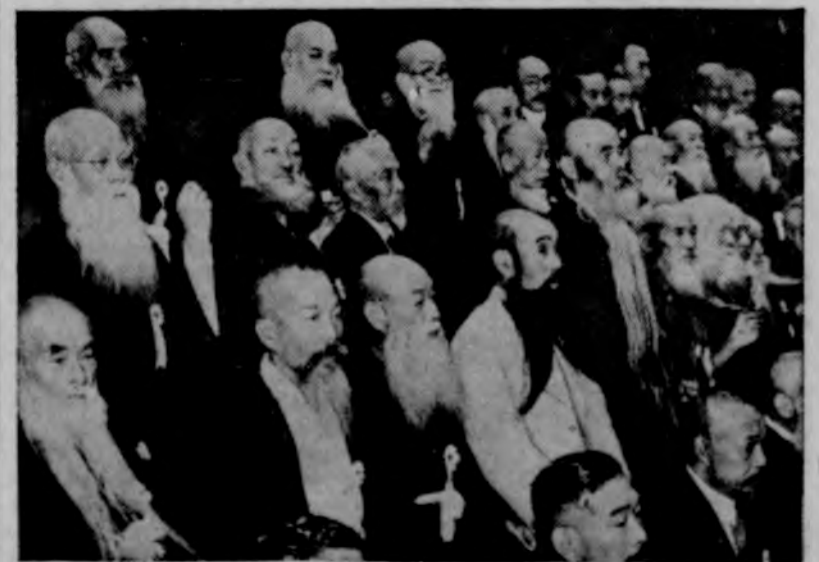
Proud contestants posing after the judging in the national beard "championships" at the Koraku restaurant in Tokyo. Some of the contestants are wealthy. Some Japanese believe that long beards bring monetary good luck because the men shown on Japanese currency all have full beards.