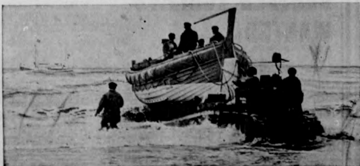
A new method of launching coast guard boats into surf is demonstrated on the coast of Holland. The equipment includes a tractor with caterpillar drive and a special truck for the boat.