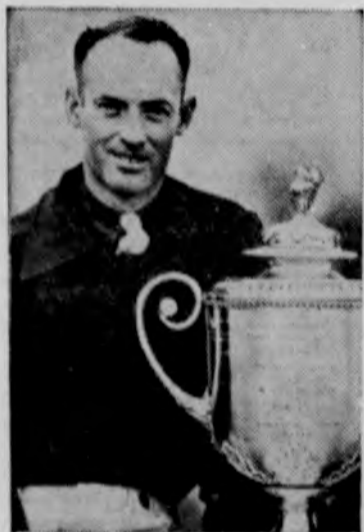
Denny Shute, professional of the West Newton, Mass., Braeburn club, with the cup he won in the national professional golfers' tournament. Denny defeated Jimmy Thomson 3 and 2 in the final 36-hole match of the P. G. A. championship tournament to win this cup, and the national pro golfing title.