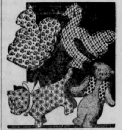
Pattern No. 5609

"Eenie, Meenie, Minie, Mo"—It's hard to decide which to make—but why make just one, why not all! Delightful cuddle toys, these, and just the soft, warm playthings for a baby's arms. There's nothing to the making of them, for each is composed of but two pieces, with the exception of the bear, whose jacket is extra, and the chick, whose flapping wings are separate. Your gayest cotton scraps can go into the making of these winning gifts. In pattern 5609 you will find a transfer pattern for the four animals; instructions for making them; material requirements.