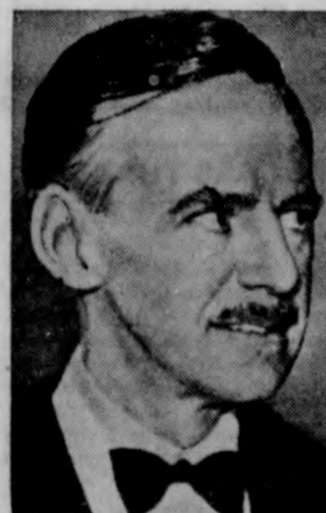
Eugene O'Neill, playwright, who has been awarded the 1936 Nobel prize in literature. O'Neill's most famous plays are: "The Emperor Jones," "Anna Christie," and "Strange Interlude." Mr. O'Neill is a native New Yorker.