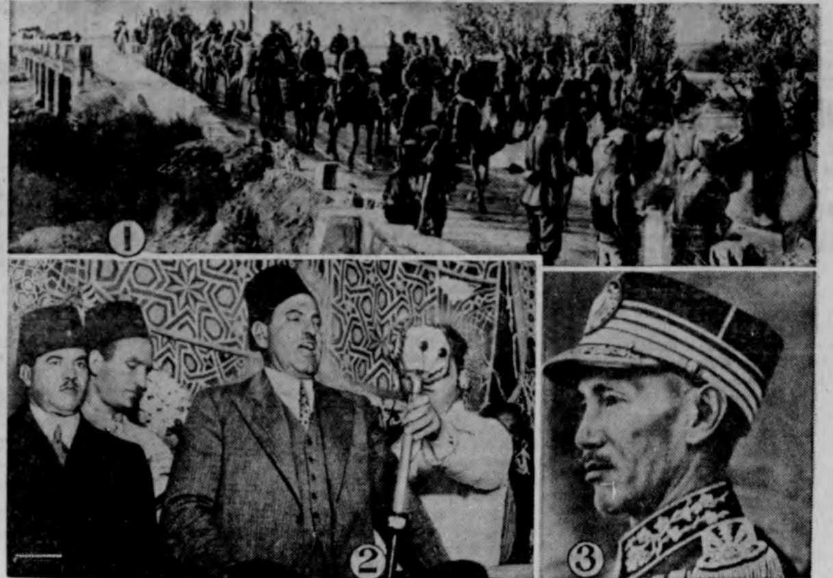
1—Mounted troops of General Franco's rebel army crossing a bridge on the march on Madrid. 2—Premier Nahas Pasha of Egypt at celebration in honor of the recent Anglo-Egyptian treaty giving further independence to Egypt. 3—General Chiang Kai-Shek, commander in chief of China's land forces as he appeared at National Chinese Boy Scout jamboree.