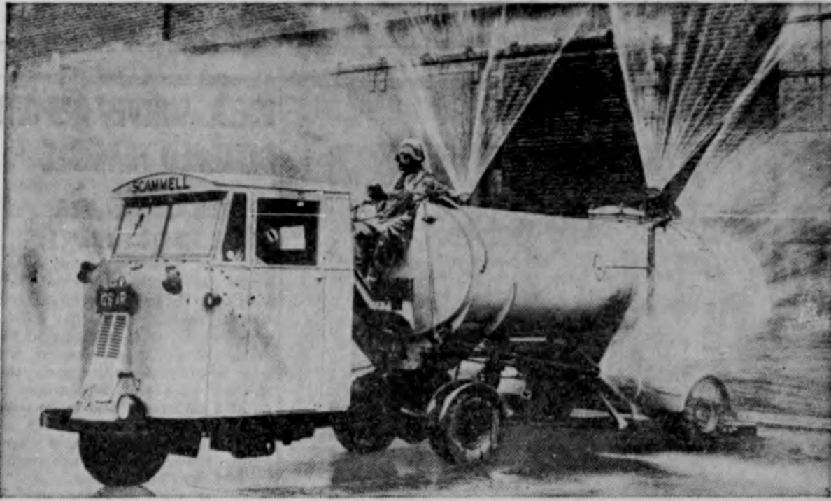
The latest development in military defense against gas attack makes use of the ordinarily un-war-like street cleaning truck. An auxiliary apparatus, attached to the truck, throws out jets of water to disperse poison gas in the air, and also sends out fan shaped sprays of water to cleanse walls and roofs which have been contaminated by poison gas. A demonstration of the new equipment is shown in London with the "crew" of the truck clad in gas proof clothing, complete with mask.