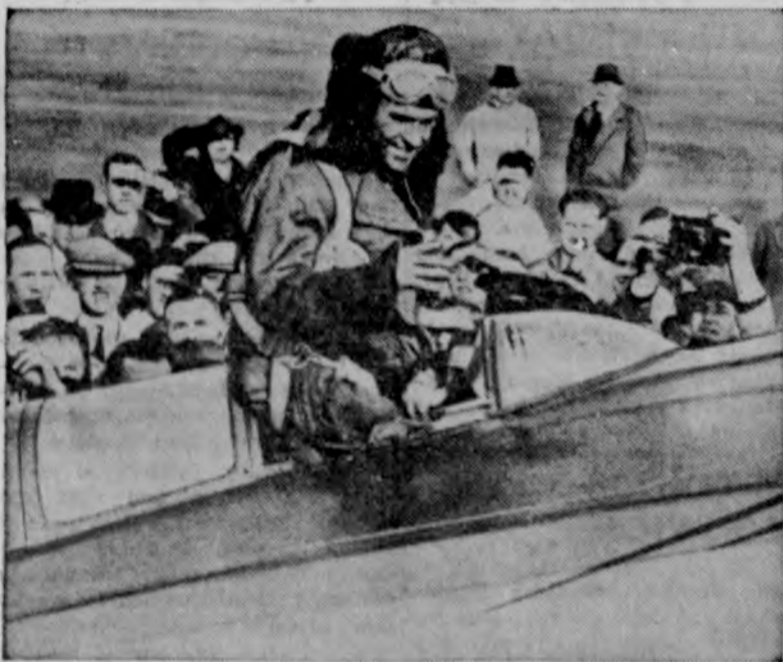
Capt. James (Jimmy) Mollison pictured at Croydon airport, London, following his recent crossing of the Atlantic in record time. He brought his plane "Dorothy Ward" to earth after being in the air 13 hours and 13 minutes on a 2,100 mile flight from Harbor Grace, Newfoundland, to London. The British flyer has a number of records to his credit.