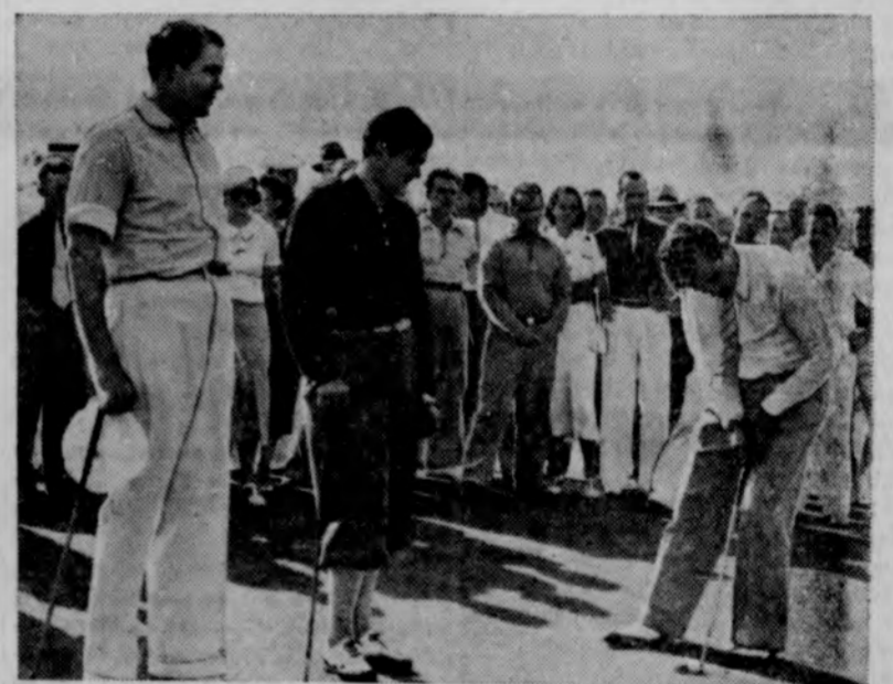
Three golf champions try their hands at Florida's latest crop of turf for the string of coming winter golf tournaments at Miami. Left to right, Ralph Guldahl, Western Open title-holder, and Lawson Little, Canadian Open champion, look on as Johnny Revolta, the reigning P. G. A. king, puts in an informal match.