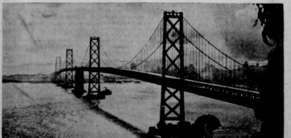
A view of the recently completed San Francisco-Oakland Bay bridge as seen from Yerba Buena island. The city of San Francisco is in the background. Steadily increasing motor traffic is using the bridge across the bay.