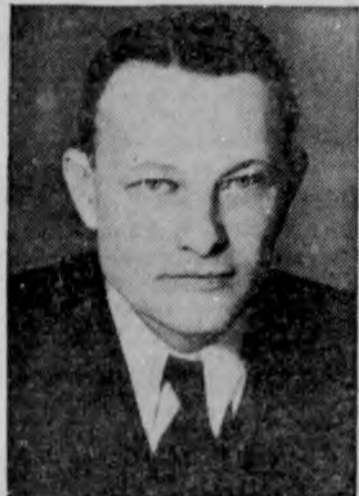
Representative Joshua Bryan Lee, A. B., M. A., LL. D., author, poet, artist, farmer and Sunday School teacher and ardent supporter of the New Deal, who was elected to the United States Senate from Oklahoma in the recent landslide Democratic victory at the polls. Familiarly known as Josh Lee, the former boy orator who became public speaking professor at the University of Oklahoma, the new senator-elect had served two years in the house of representatives.