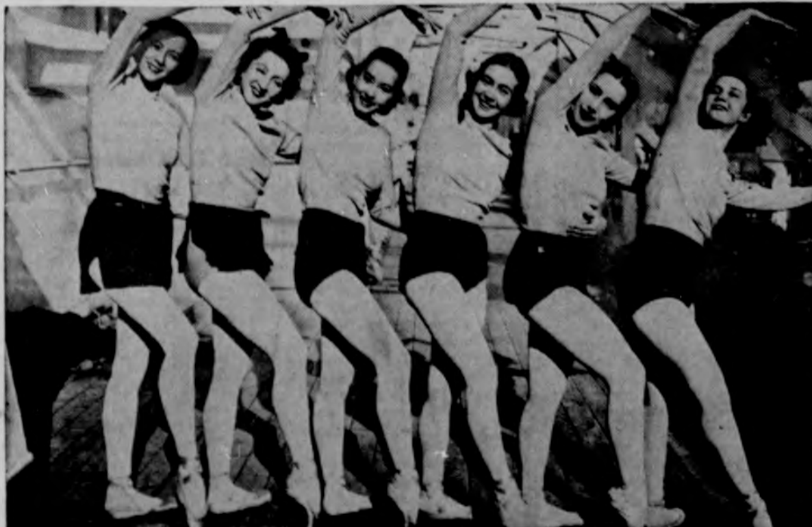
A group of French ballet dancers pictured aboard the S. S. Ile de France on their arrival in New York. They formed an unusual treat for the eyes of ship news photographers.