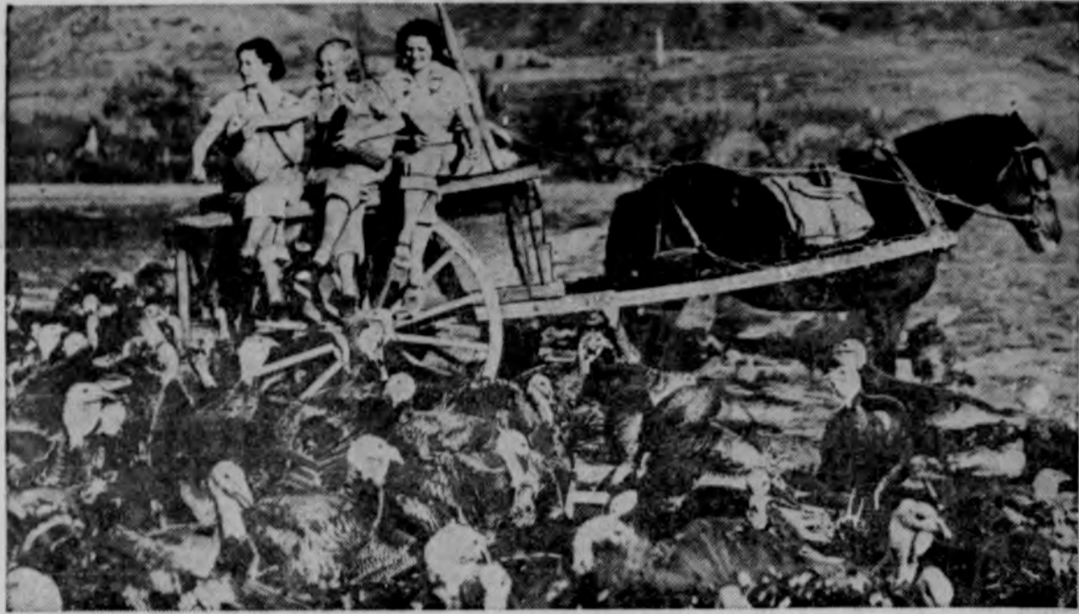
A million turkeys are being fattened by the Northwestern Turkey Growers in Utah who supply a great percentage of America's holiday birds. At this time each year, pretty Utah rancherettes help to feed and round up the choice birds which will soon grace Thanksgiving tables. Fair trio are seen feeding turkeys from the water wagon on a large Utah turkey ranch.