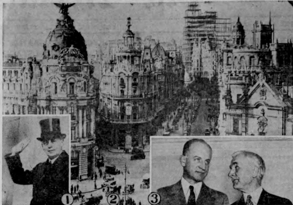
1—Joachim Von Ribbentrop, German ambassador to London, photographed on his way to his official office. 2—View of Madrid, Spain—the prize for which the rebels and loyalists have been contending for months. 3—Secretary of State Cordell Hull (right) and Assistant Secretary Sumner Welles enroute to Pan-American peace conference in Buenos Aires.