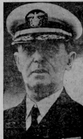
Admiral William D. Leahy has been selected by President Roosevelt as the new chief of naval operations, succeeding Admiral William H. Standley, who is retiring. Admiral Leahy has been commander-in-chief of the navy's battle force with the rank of full admiral.