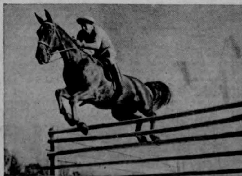
Bluebloods of horse flesh from the leading horse breeding states are competing for honors at the International Horse show at Chicago, which is a daily feature of the International Live Stock exposition. One of the most coveted prizes is the $1,000 jumper stake. Horse and rider are shown in competition for this honor. Foremost among expositions of its kind in the world, the stock show yearly attracts thousands of farmers from every state in the Union and neighboring Canada.