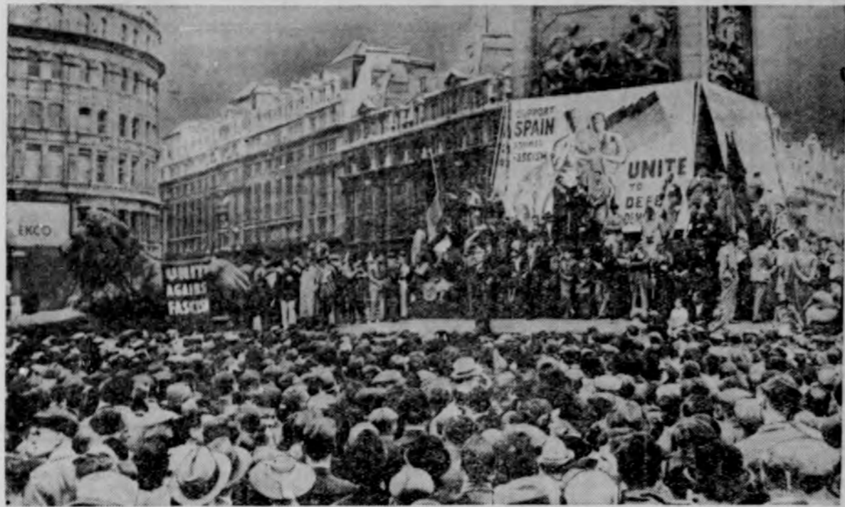
London's famous Trafalgar Square packed by British members of the Communist party as leaders addressed them during the recent unity demonstration in "Aid of Spain."