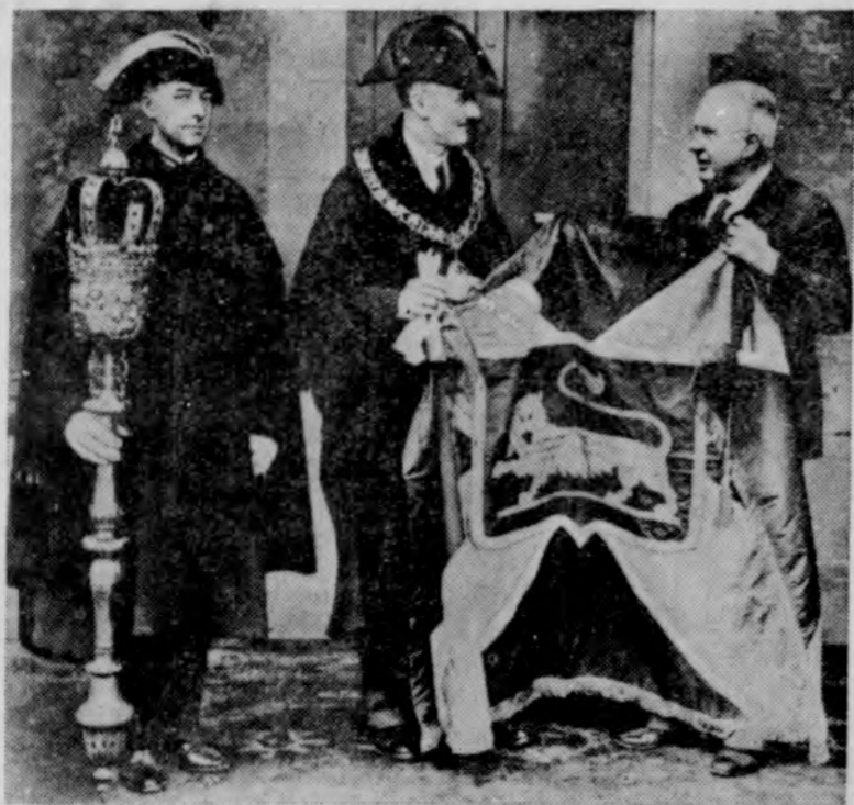
An interesting ceremony is pictured here as Mayor C. R. Anderson of Winchester, Va., presents a flag of the American city to Mayor A. T. Edmonds of Winchester, England. The American mayor is in mufti. The flag was presented as a token of good-will from the modern American city to its ancient namesake.