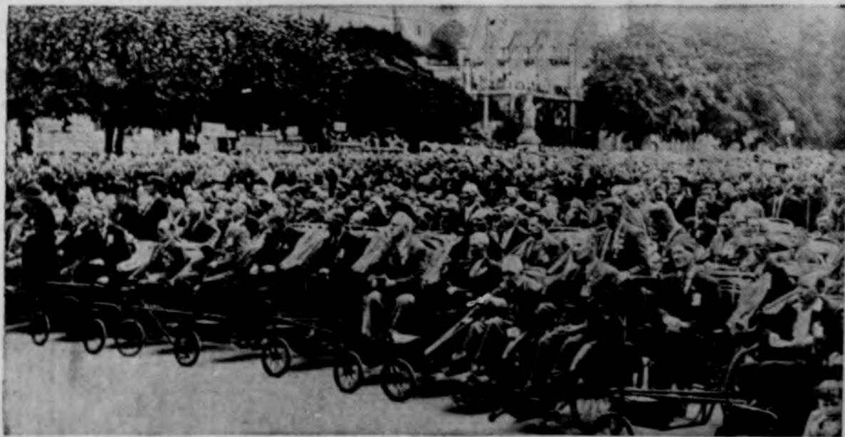
Gathered before the miracle working shrine of Our Lady of Lourdes, in France, battered war veterans from all the nations of Europe—many of them former enemies—joined in prayers for peace. A hundred and fifty thousand veterans made the pilgrimage to this year's peace congress at the grotto.