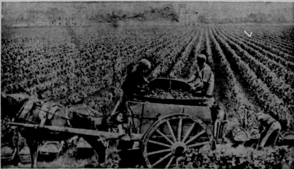
Vineyard workers gathering a bumper crop of luscious grapes at Vougeot, France, near Dijon, an area famous throughout the world for the quality of its vintages.