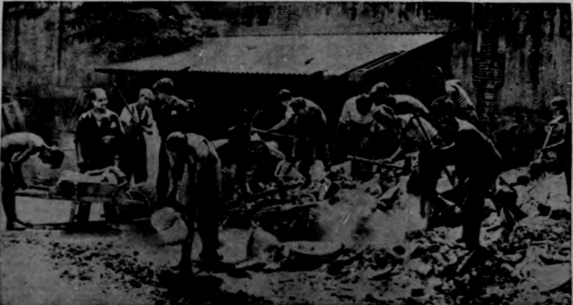
Members of the Iberian Anarchist federation dismantling the ancient Seminary of Barcelona preparatory to converting the establishment into a university of the Popular party.