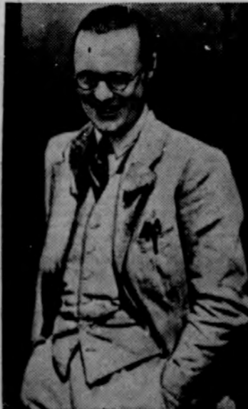
Prince Bernard Zur Lippe-Biesterfeld of Germany, whose engagement to Princess Juliana of Holland was announced recently.