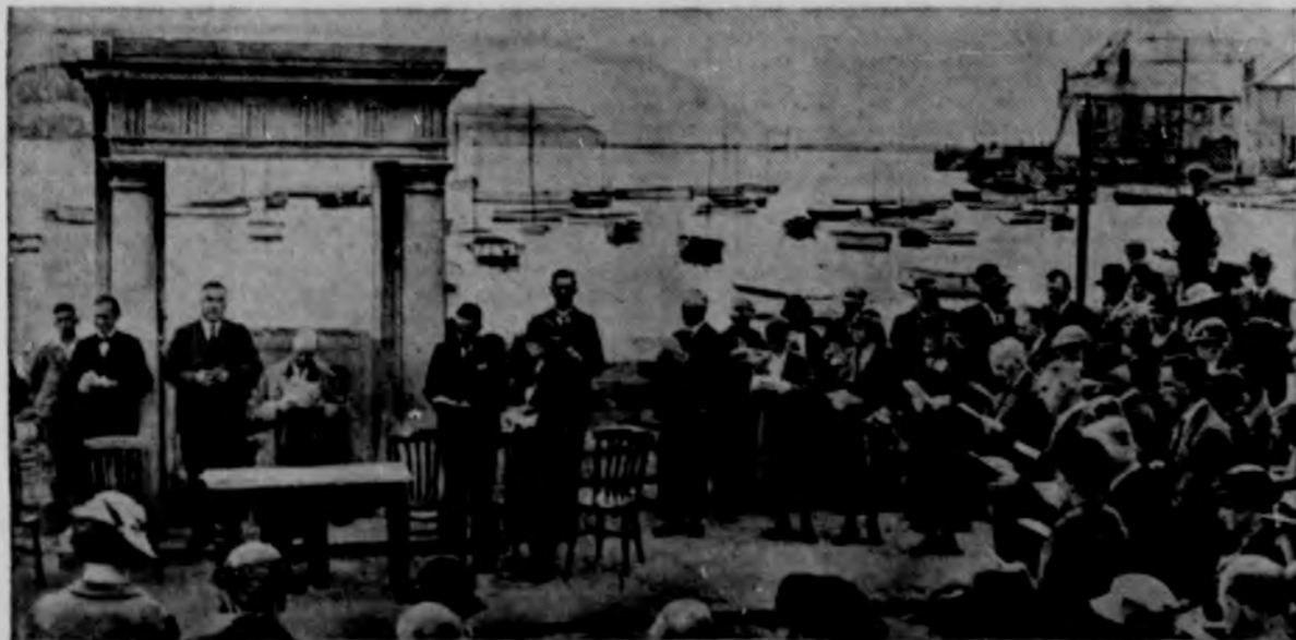
Representatives of American and British societies celebrated the anniversary of the sailing of the Mayflower in 1620 at the actual spot on the Barbican at Plymouth, Devonshire, England.