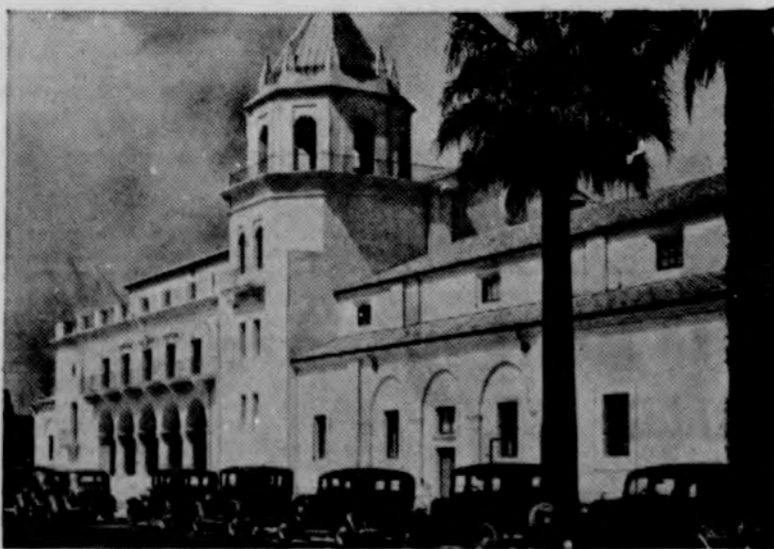
Here, beautifully situated amid palms, is the new municipal auditorium in San Jose, Calif. It was erected with the aid of a PWA grant of $500,000, and is the first unit of the city's proposed civic center. Other imposing buildings are expected to form a part of this new development, which will make San Jose one of the most imposing cities of California.