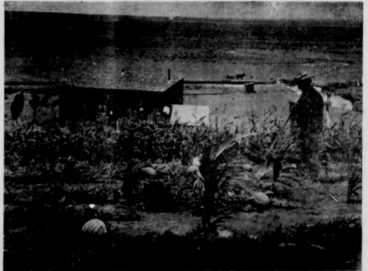
Early settlement scene in 1908. Leather's cabin, A. C. Drop canal, now Alpha Christley ranch. View over Columbia district looking into unsettled district.