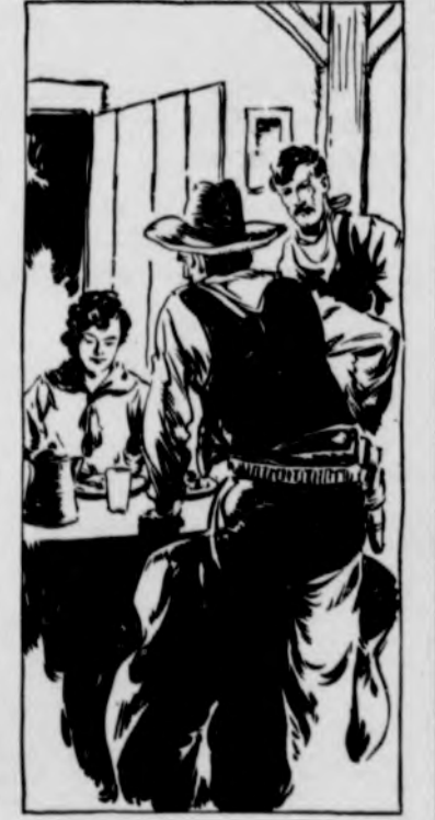
"You Must Have Been Trying Not to Find Me," Said Jane Coldly.

"I was afraid you'd fall off your horse," he retorted dryly. "Now skip the hard words," he countered easily as Jane angrily objected to his taunt and to his company. "You know your