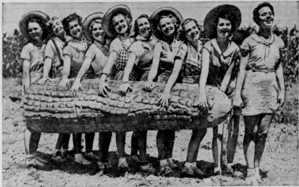
It really doesn't grow this large in Southern California, but this oversized ear of corn has been prepared for one of the displays of the famous Los Angeles county fair which opens at Pomona in September.