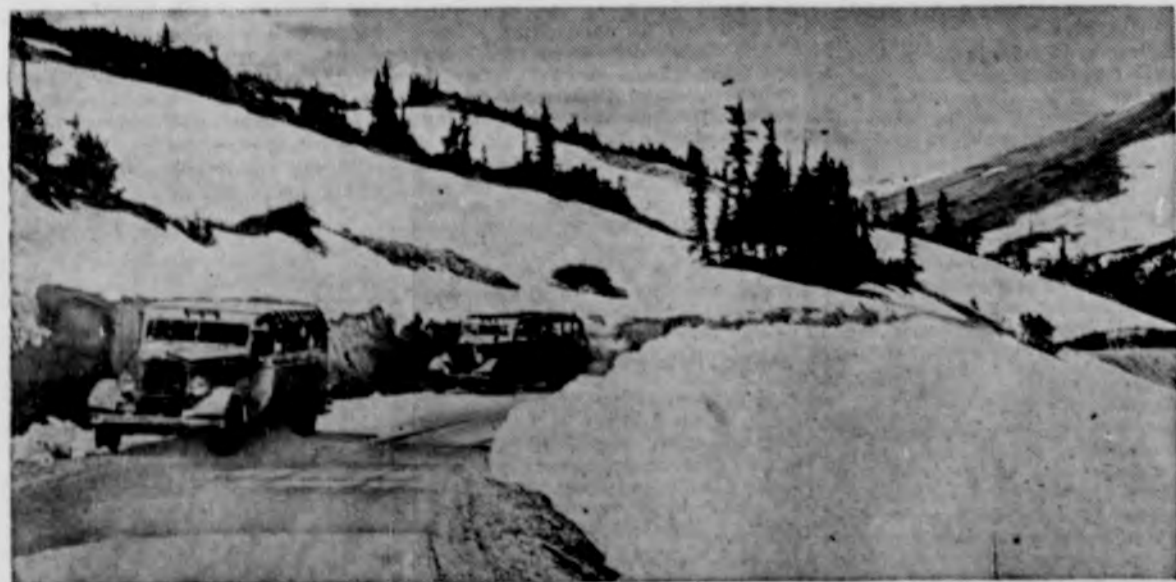
This picture, taken during the unprecedented hot spell that afflicted most of the country, shows a view along the Trail Ridge road in Colorado's Rocky Mountain national park.