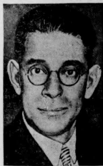
Recent photograph of Gen. Emilio Mola, in command of the northern army of Spanish Fascist rebels.