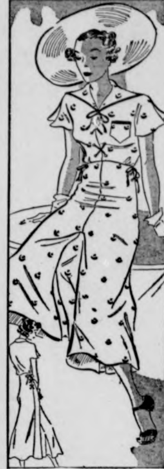
Pattern No. 1922-B

running down the street to the grocer's.