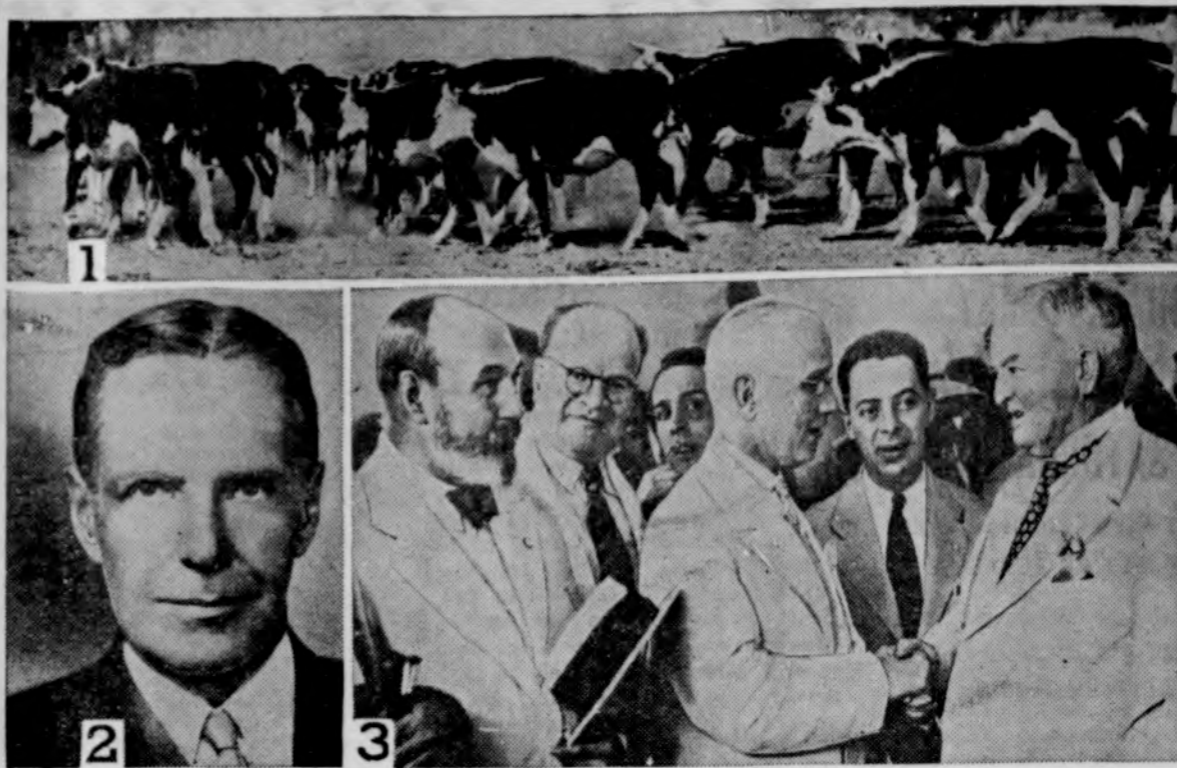
1—Drouth-stricken cattle being driven to a rail head from Pierre, S. D., for shipment to the eastern part of South Dakota. 2—Under Secretary of State William Phillips who is mentioned as successor to Breckinridge Long, as ambassador to Italy. 3—Vice President John N. Garner (right) and Gen. Eduardo Hay, Mexico's secretary of foreign affairs, at dedication of Pan-American highways at Laredo, Texas.