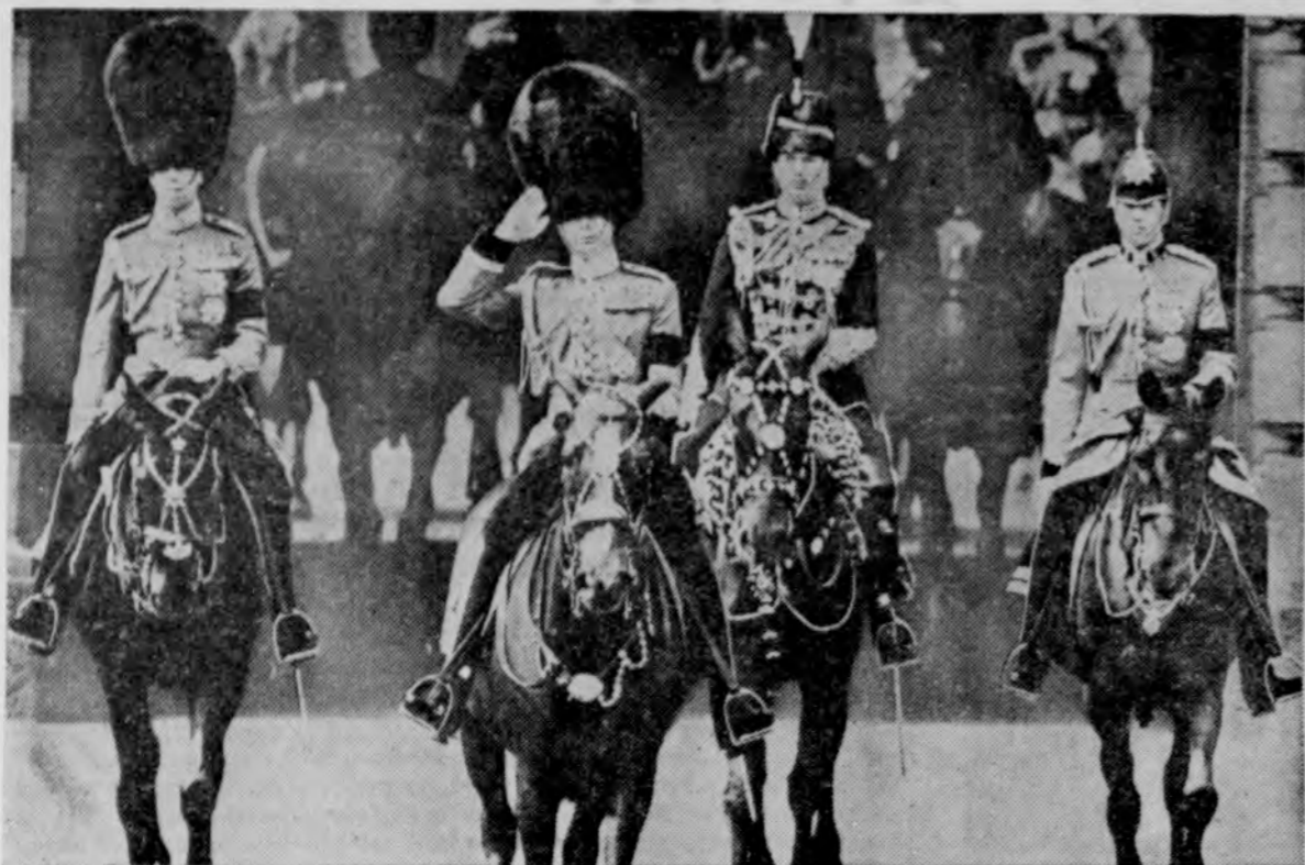
Celebrating his forty-second birthday, King Edward VIII, second from left, leaves Buckingham palace with his three brothers as they attend the trooping of the color at the horse guards' parade. Left to right are, Duke of York, the king, Duke of Gloucester and Duke of Kent.