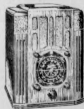
ZENITH MODEL 10-S-130 A big 10-tube chassis ingeniously built into a table cabinet. Foreign reception guaranteed. Has the Big Black Zenith 1937 Dial and new features.

AMERICA'S MOST COPIED RADIO ALWAYS A YEAR AHEAD