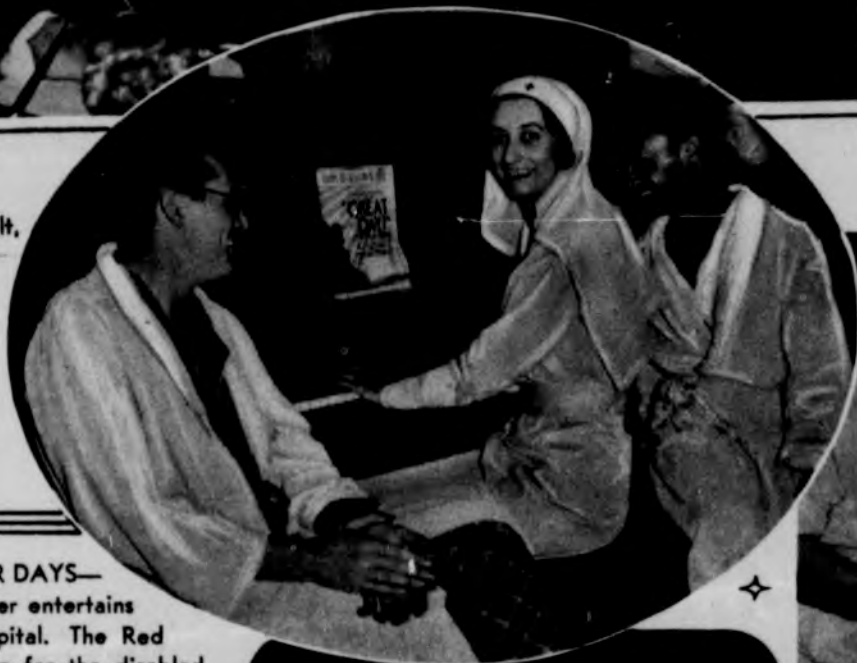
JUST LIKE WAR DAYS— Red Cross worker entertains veterans in hospital. The Red Cross carries on for the disabled 17 years after close of war.