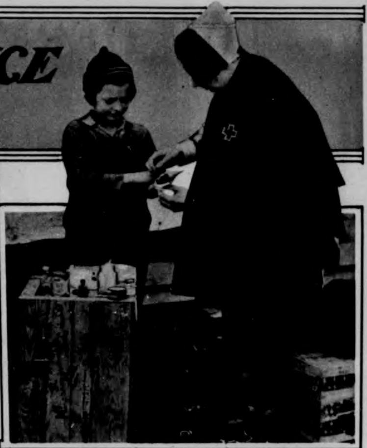
RED CROSS IN ALASKA— A nurse sent by Red Cross with pioneering families to Matanuska valley, Alaska, aids one of the little pioneers.