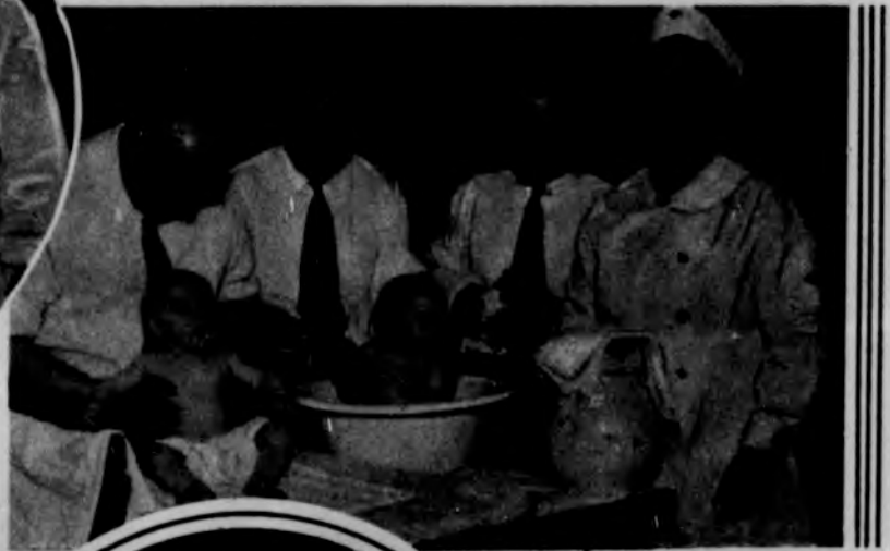
EVEN FATHERS LEARN HOME HYGIENE AND CARE OF THE SICK— A Red Cross course which has taught thousands of girls and women interests men, too. These twins were living exhibits in "how to bathe the infant."