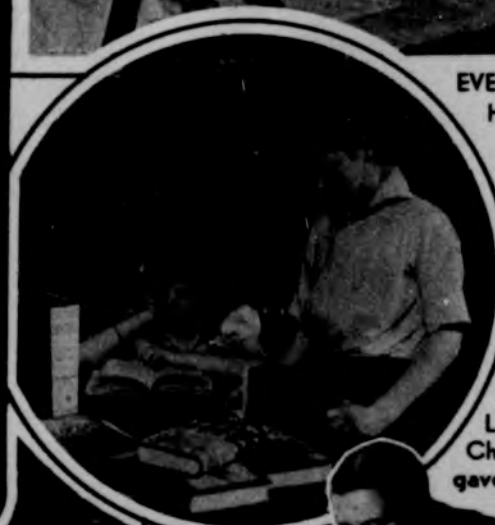
JUNIOR RED CROSS GIFT LIBRARIES— From its National Children's Fund, Junior Red Cross gave 85 libraries to rural schools.