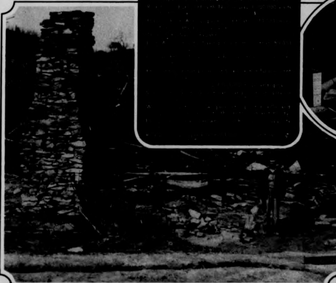
ONCE A HOME STOOD HERE— Tornado damage in North Carolina, where Red Cross rebuilt many homes similar to this for families without resources.