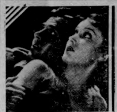
"THE MOST DANGEROUS GAME" Oasis Theatre, Sundry and Monday.