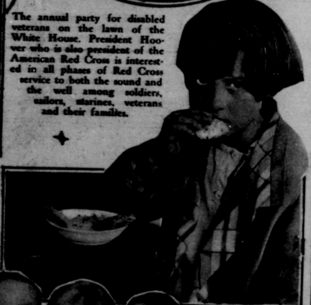
Currants from Greece were used in these cookies baked by Juniors and served in school lunches in drought areas. There are 12,000,000 Juniors in the world, bound together by mutual understanding and ideals.