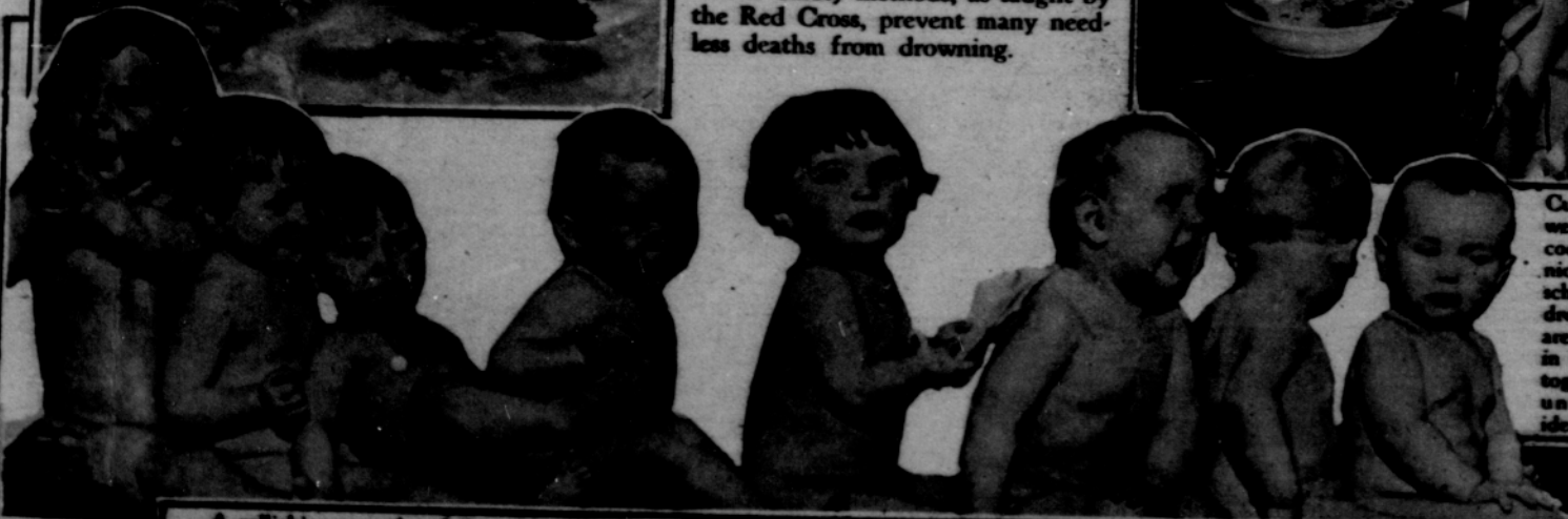
A relishing row cheerfully expounding the principle, "Keep well babies well!" at a baby welfare conference conducted by the Red Cross Public Health Nursing Service.