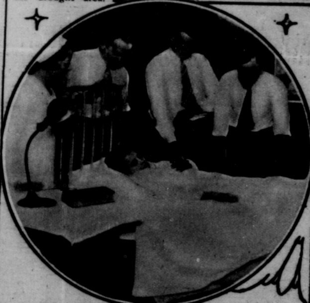
Men's classes are popular features of Home Hygiene and Care of the Sick.

Bits of cheer at Christmas time—80,000 boxes spread good will and happiness round the world. An important phase of Junior activities.