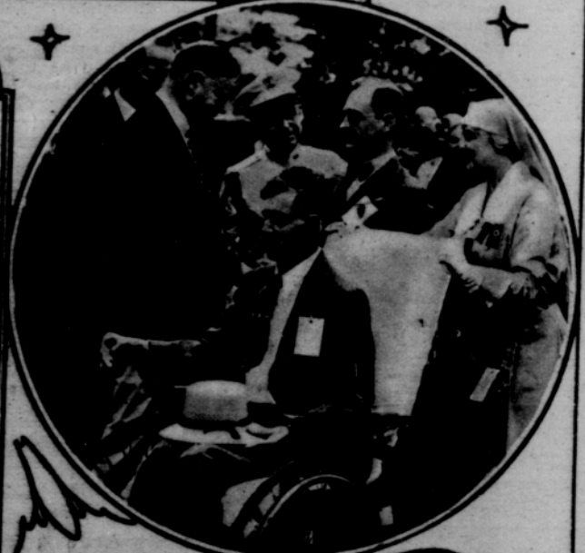
The annual party for disabled veterans on the lawn of the White House. President Hoover who is also president of the American Red Cross is interested in all phases of Red Cross service to both the sound and the well among soldiers, sailors, marines, veterans and their families.

Says Chief Justice Charles Evans Hughes: "The American Red Cross represents the united, voluntary effort of the American people in the ministry of mercy. It is the best and most effective expression of the American heart."