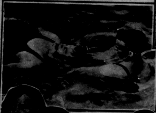
Water Safety methods, as taught by the Red Cross, prevent many needless deaths from drowning.