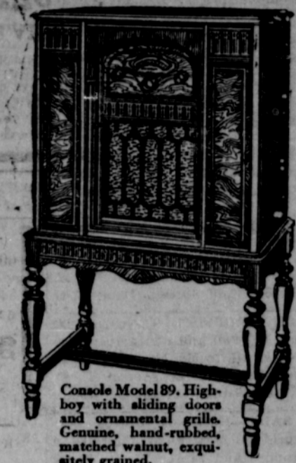
Console Model 89. Highboy with sliding doors and ornamental grille. Genuine, hand-rubbed, matched walnut, exquisitely grained.