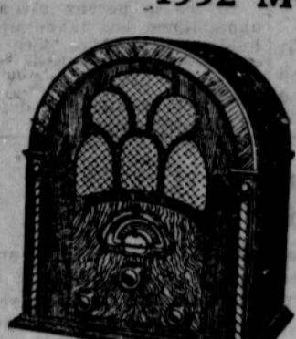
$65.00 COMPACT MODEL 80. Here are 1932 improvements in small space. Model 82 with automatic volume control $72.50.

In all our experience we've never seen a radio that could match this new Atwater Kent highboy. Finest radio that can be built! Every up-to-the-minute feature, from automatic volume control and tone control to Golden Voice electro-dynamic speaker with the famous singing tone quality that enraptures every listener. Tubes include the new variable-mu's and two pentodes in push-pull. Cabinet approved by famous decorators as "the kind one likes to live with." Low prices—yes! But behind the price tags here are VALUE and LASTING SATISFACTION. 3,000,000 Atwater Kent owners prove it. Call or phone for personal demonstration. No obligation. Lowest terms.