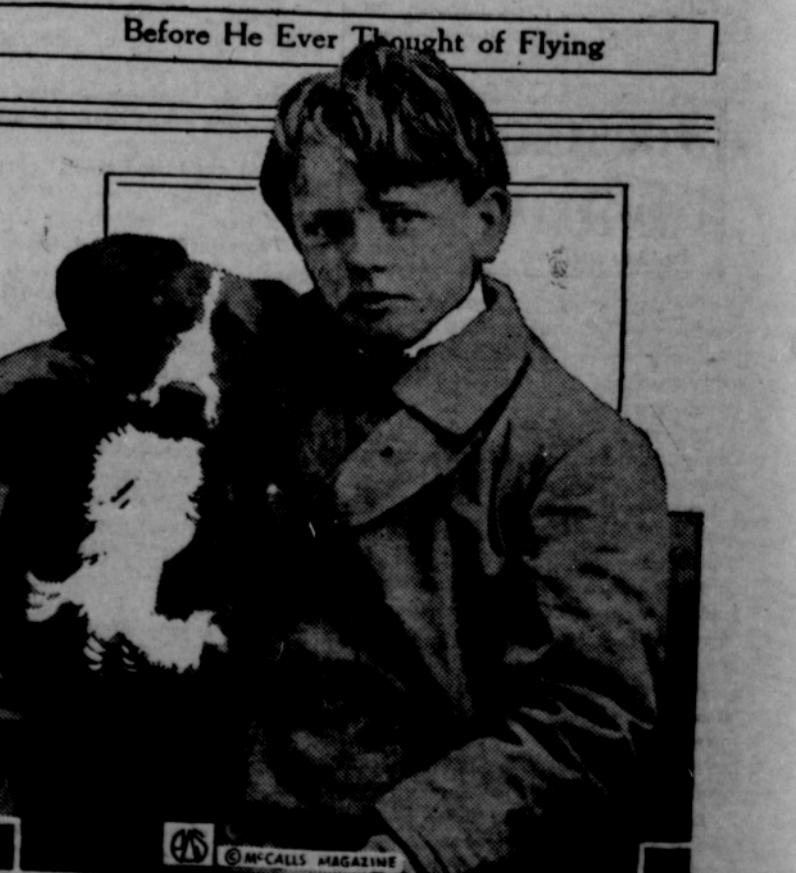
Col. Lindbergh was a real American boy twenty-odd years ago, even in his love for dogs. Whatever he expected to become, at that time, it certainly was not an aviator.